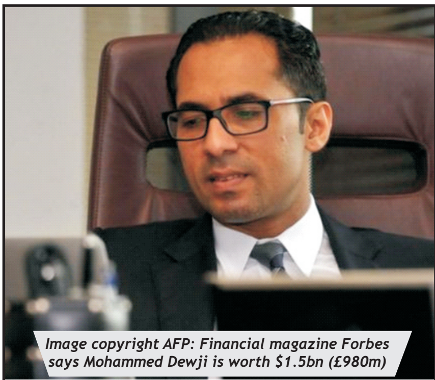
Financial magazine Forbes says Mohammed Dewji is worth $1.5bn (£980m)

Cameroon's English speakers say they have been marginalised for decades by the predominantly Francophone government. BBC