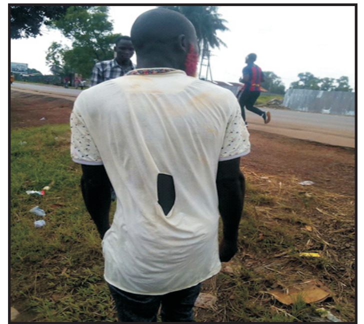
photo after his release from jail

However, the U.S. Embassy in Liberia, through USAID says it has reached out to independent, internationally recognized firms with specialization in forensic investigations to conduct a scoping mission that could ascertain the basic facts of the alleged missing currency in Liberia and determine to what extent a broader mission would be needed.