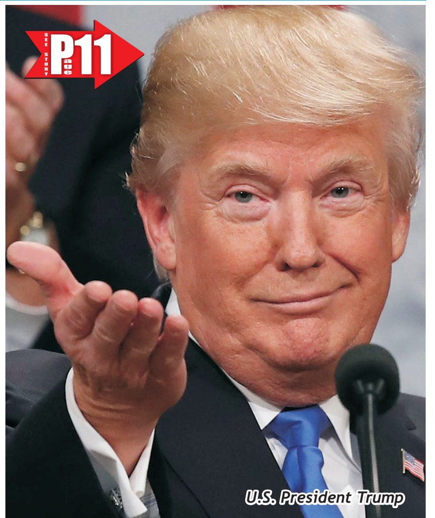
U.S. President Trump