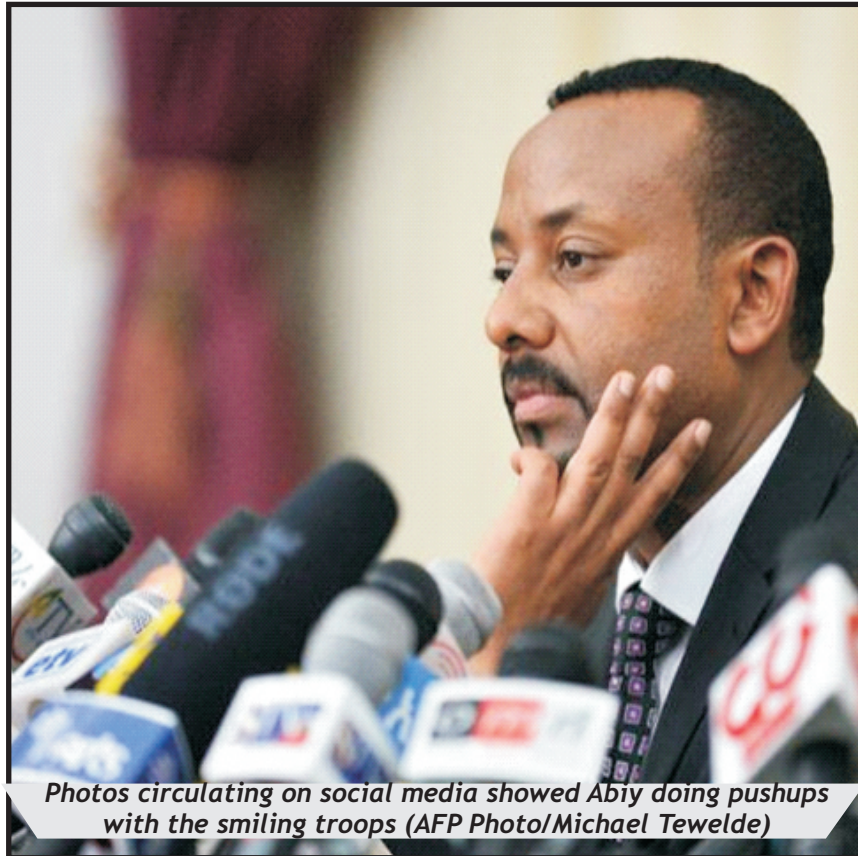
Photos circulating on social media showed Abiy doing pushups with the smiling troops

ENA says the soldiers involved in Wednesday's incident had been deployed to Burayu, a suburb of Addis Ababa where at least 58 people were killed last month in fighting between the Oromo and other ethnic groups. -AFP