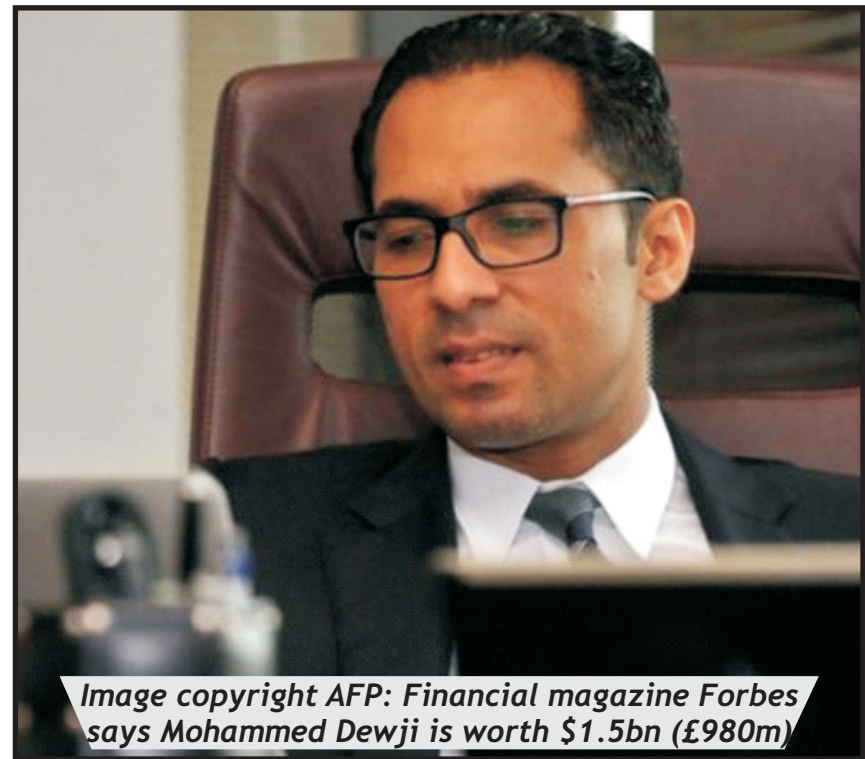
Financial magazine Forbes says Mohammed Dewji is worth $1.5bn (£980m)

Other mayoral candidates with mixed heritage have begun to enter politics in Belgium in recent years. Emir Kir, the son of Turkish immigrants, and was elected mayor of Saint-Josse in 2012; and Nadia Sminate, whose father was from Morocco, was elected the leader of Londerzeel in 2016. -BBC