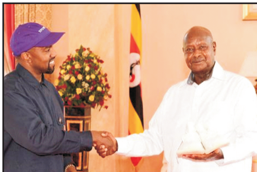
Kanye West gives Ugandan President Yoweri Museveni a pair of white sneakers, as the serial Grammy-winning artist visits the east African nation to finish recording his ninth studio album "Yandhi"

known as Africa, I have to go and find out what it is really called and just grab the soil and cook five meals a day so the metabolism stays up and... have the mic in the open so you can hear nature while we are recording," West told entertainment site TMZ. -AFP