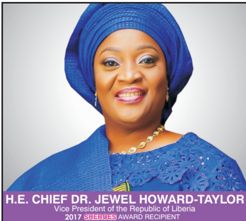
H.E. CHIEF DR. JEWEL HOWARD-TAYLOR Vice President of the Republic of Liberia 2017 SHEROES AWARD RECIPIENT