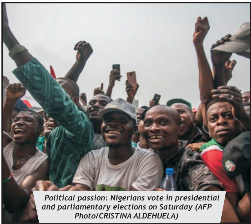
Political passion: Nigerians vote in presidential and parliamentary elections on Saturday

"Some of these achievements are visible for everyone to see. Some are still in the works," he said in a video message, asking for support "to consolidate" the progress so far. BBC