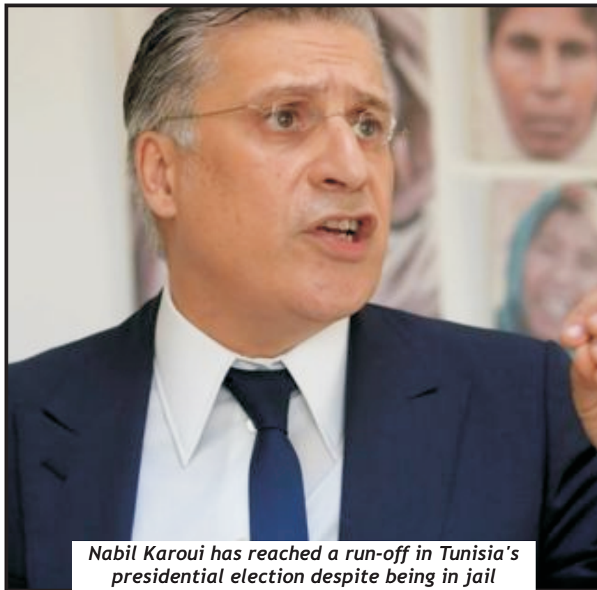
Nabil Karoui has reached a run-off in Tunisia's presidential election despite being in jail

prime minister, chosen by parliament, is responsible for other portfolios. Separately, parliamentary elections are also scheduled to take place next month. This election is the second free presidential poll since the 2011 uprising that toppled ex-President Zine al-Abidine Ben Ali and sparked the Arab Spring. It was brought forward after the death in July of the country's first democratically elected president, Beji Caid Essebsi, who took office in 2014. BBC