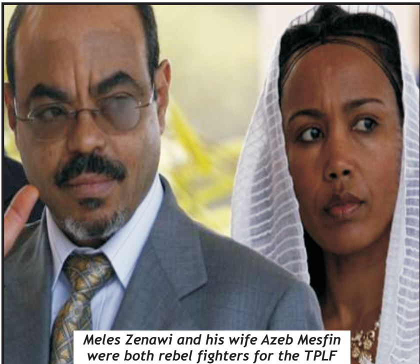
Meles Zenawi and his wife Azeb Mesfin were both rebel fighters for the TPLF

banned protests planned by the opposition over Mnangagwa's handling of the economy. The demonstrations were viewed as a test of Mnangagwa's willingness to tolerate dissent in a country tainted by a long history of repression under his predecessor Robert Mugabe, who died on Sept. 6 in Singapore. AFP