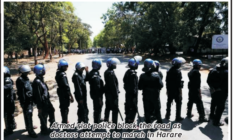
Armed riot police block the road as doctors attempt to march in Harare