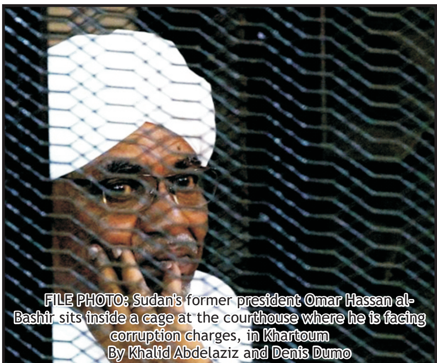
FILE PHOTO: Sudan's former president Omar Hassan al-Bashir sits inside a cage at the courthouse where he is facing corruption charges, in Khartoum

The case caused outrage and prompted demonstrations across the country.