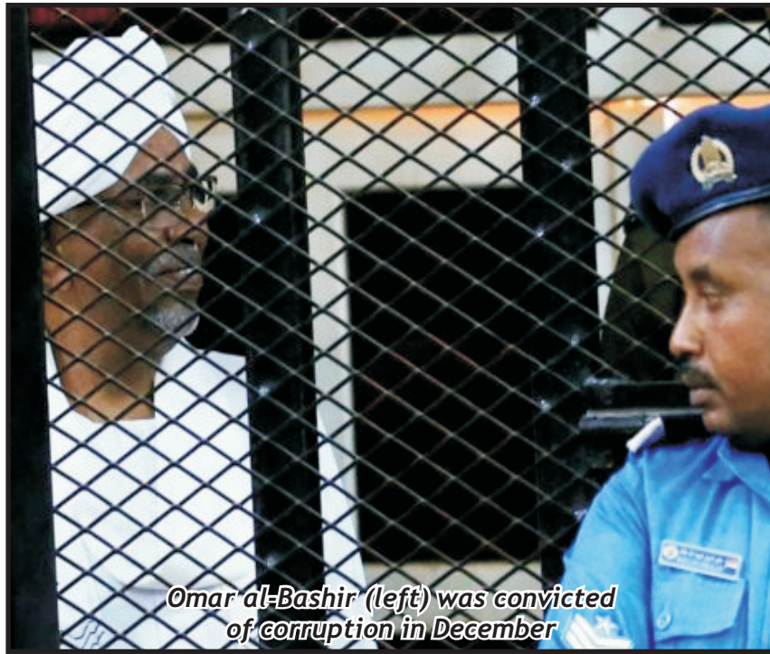
Omar al-Bashir (left) was convicted of corruption in December

told Reuters news agency that Bashir would continue to refuse to deal with the ICC, describing it as a "political court". ICC prosecutors in The Hague requested that the former leader stand trial over the Darfur killings and issued an arrest warrant for him on charges of genocide, war crimes and crimes against humanity. The UN says that in addition to those killed in fighting between local armed groups, and Bashir's forces and government-backed militia - such as the infamous Janjaweed - around 2.5 million people were displaced in the war. Warrants for Bashir's arrest were issued in 2009 and 2010 by the ICC. BBC