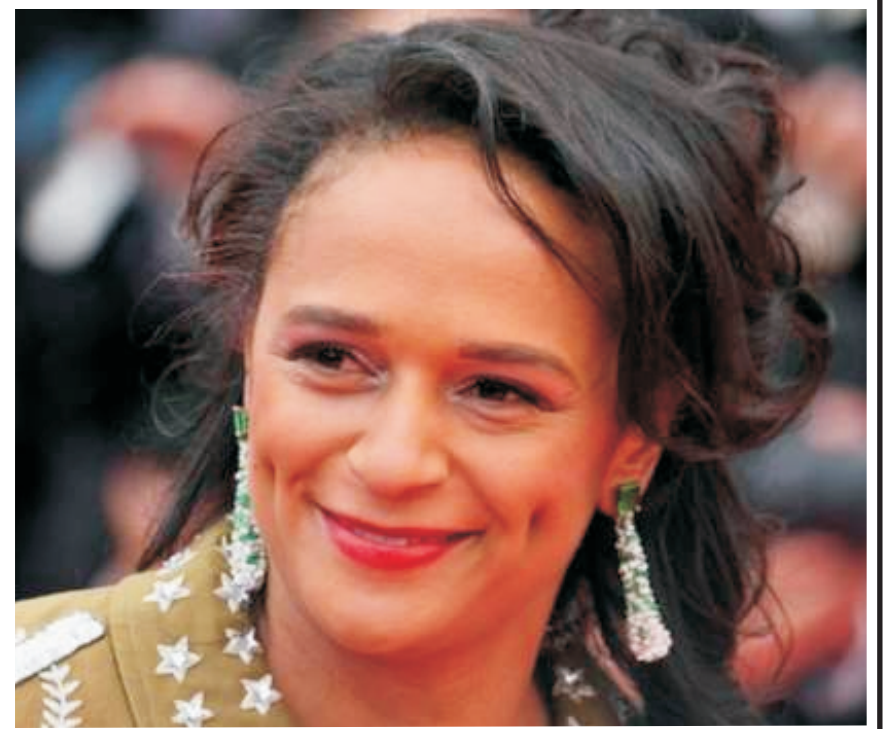
Isabel dos Santos says the allegations against her are entirely false

Dozens of bank accounts belonging to the Angolan businesswoman Isabel dos Santos have been frozen in Portugal at the request of the authorities in Angola, Portuguese media, including the newspaper Expresso, are reporting.