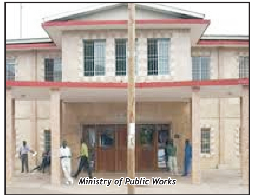
Ministry of Public Works

The CSA’s regulations, among others, states that any Civil Servant who commits an act of theft while in the