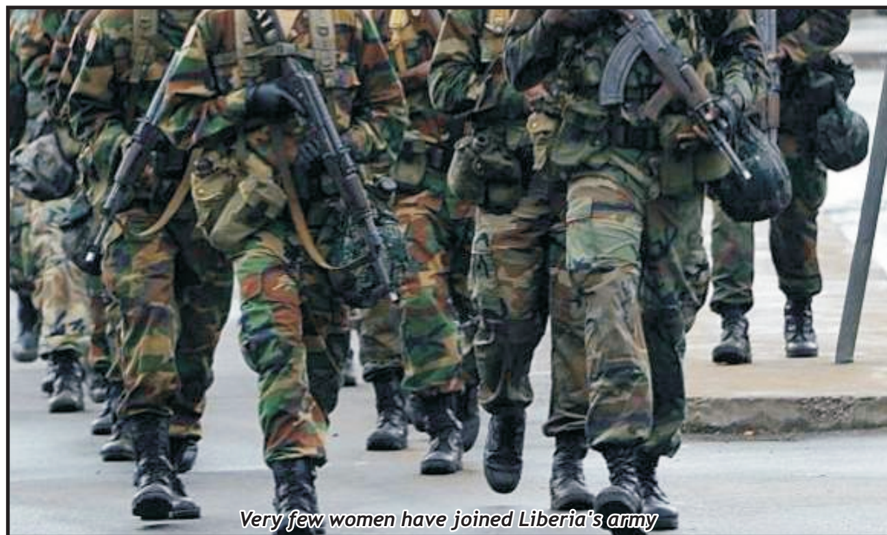
Very few women have joined Liberia's army

The army chief of staff said: "We will take four weeks to prepare you."