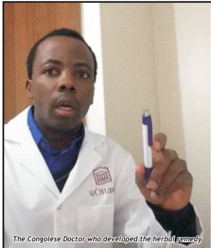
The Congolese Doctor who developed the herbal remedy

Artemisia, the plant which the Covid-Organics is made of is used in traditional