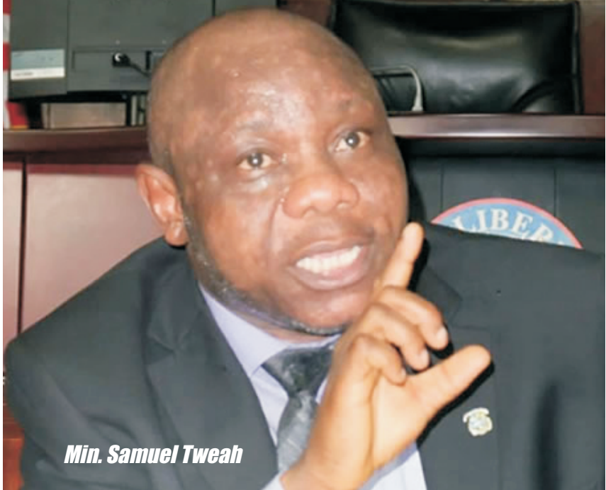
Min. Samuel Tweah