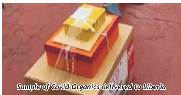
Sample of Covid-Organics delivered to Liberia

according Deputy Press Secretary Smith Toby. The current samples includes two boxes for prevention and one box for treatment.