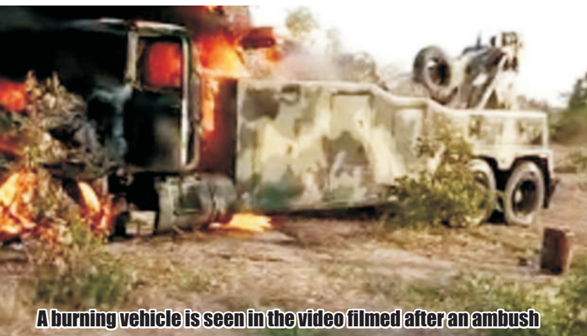
A burning vehicle is seen in the video filmed after an ambush

For years troops fighting to end the decade-long Boko Haram insurgency in the north-east have been complaining of being ill-equipped despite huge sums of