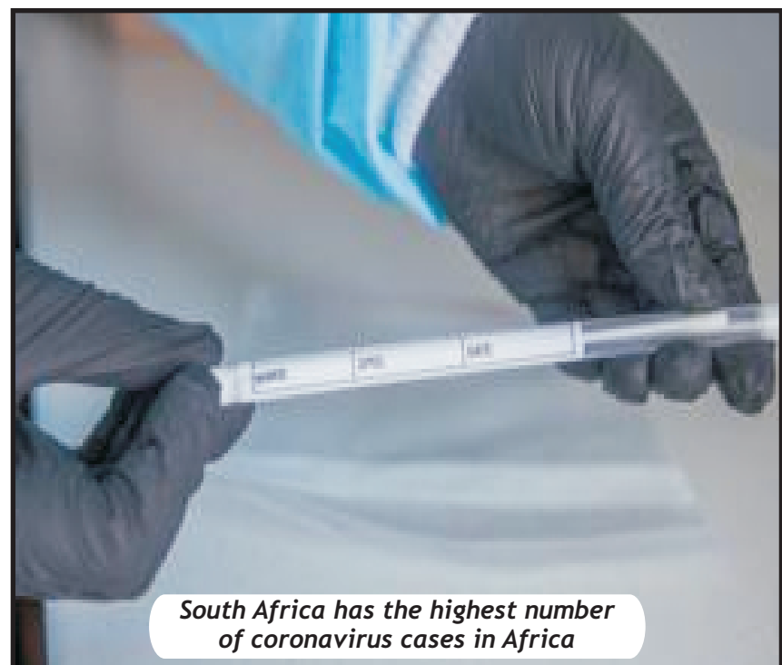
South Africa has the highest number of coronavirus cases in Africa

South Africa has had some of the strictest lockdown measures in the world, including a ban on cigarettes and alcohol, but is now easing some restrictions. BBC