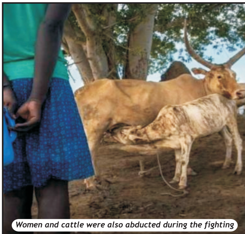
Women and cattle were also abducted during the fighting

Security agencies have said they have recovered hundreds of illegal firearms - including rifles, rocket-propelled grenades and hand grenades - from the warring communities. BBC