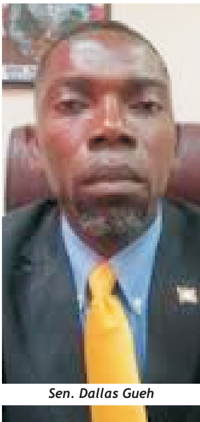
Sen. Dallas Gueh