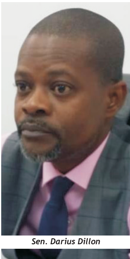
Sen. Darius Dillon