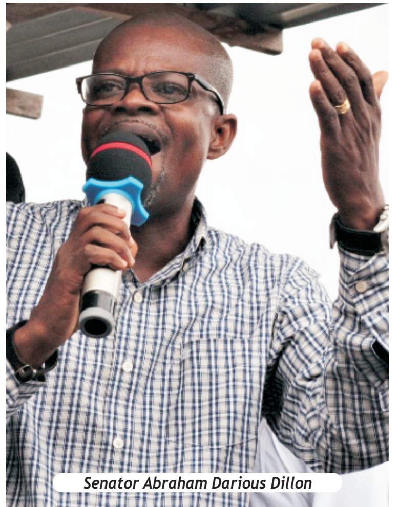
Senator Abraham Darius Dillon