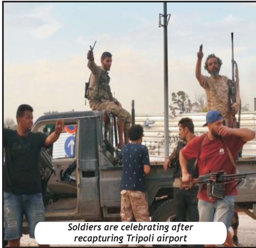
Soldiers are celebrating after recapturing Tripoli airport

Gen Haftar is also backed by the United Arab Emirates and Egypt, while the GNA enjoys the support of Turkey, Qatar and Italy. BBC