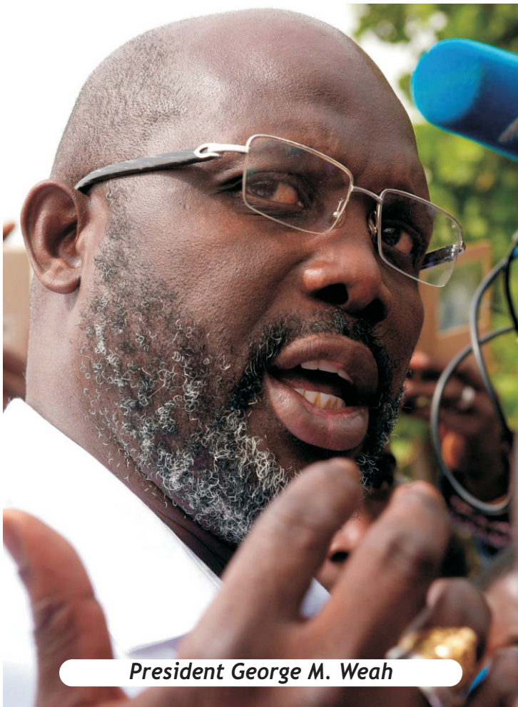
President George M. Weah