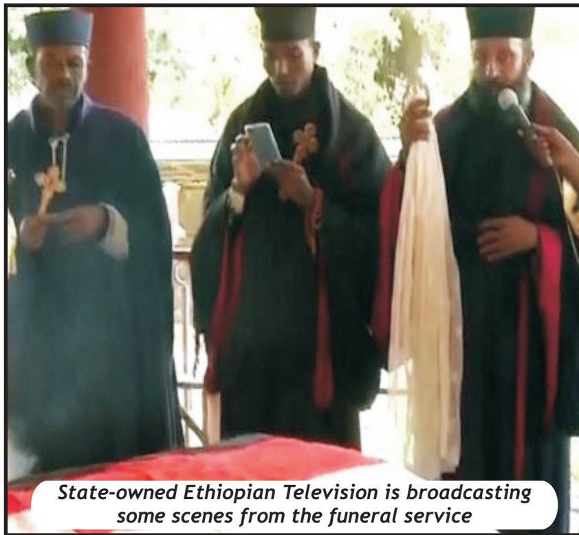
State-owned Ethiopian Television is broadcasting some scenes from the funeral service

He released his first album Sanyii Mootii (Race of the King) in 2009, a year after walking free, and it turned him into a music star, and a political symbol of the Oromo people's aspirations. BBC