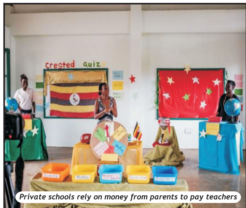
Private schools rely on money from parents to pay teachers

Property agents say their clients are desperate to pay off the bank loans that they had used to set up the institutions. BBC