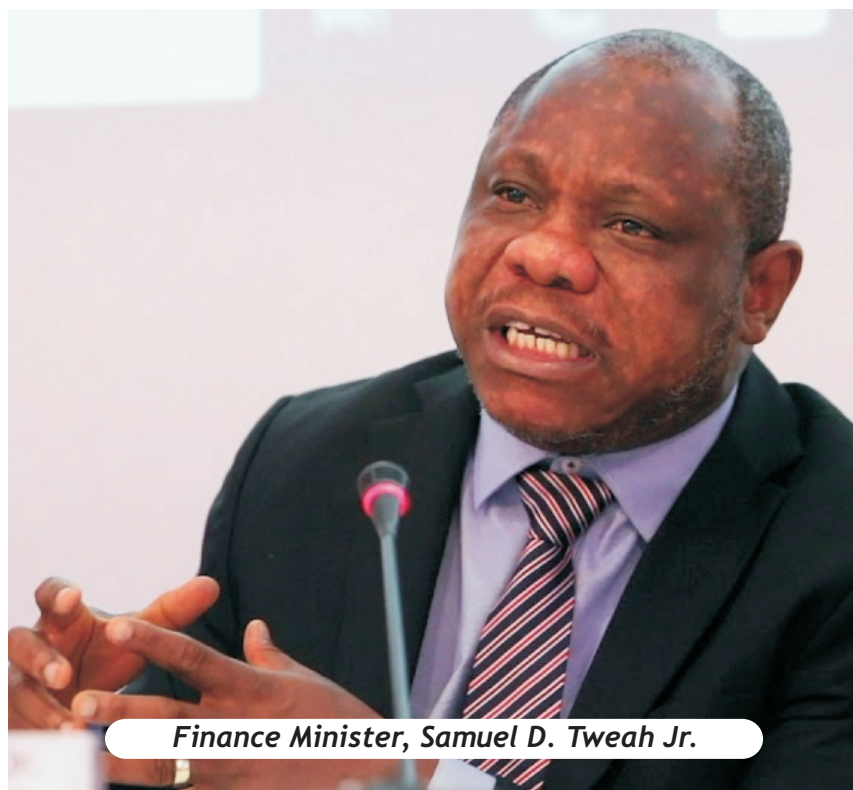
Finance Minister, Samuel D. Tweah Jr.

The Cheesemanburg Landfill and Urban Sanitation project for Liberia is to provide access to solid waste management (SWM) services in Monrovia.