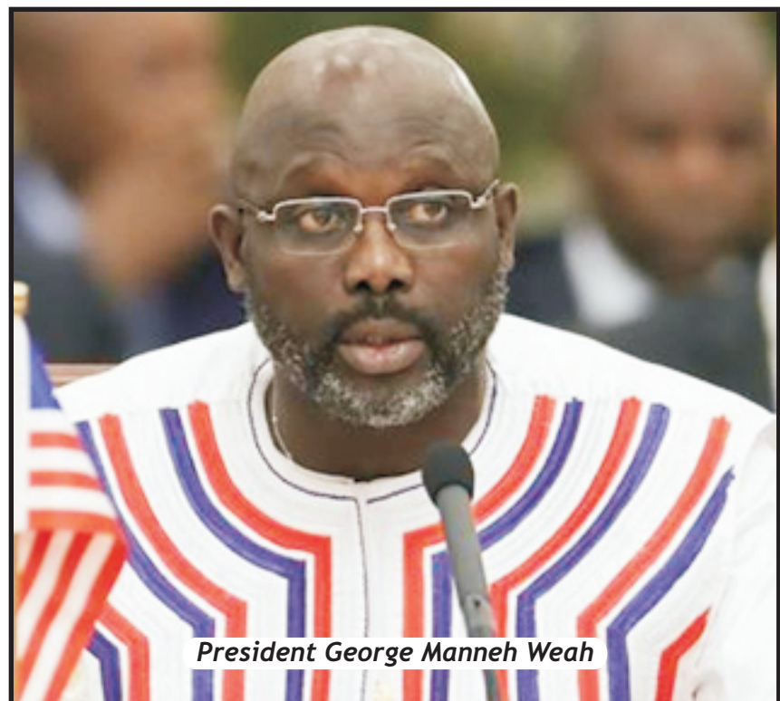
President George Manneh Weah

delivered during observance of Liberia's 173rd Independence Day Monday, 27 July, Mr. Weah said this has also resulted in food shortages, rising inflation and negative projections of gross domestic product (GDP) growth, among others.