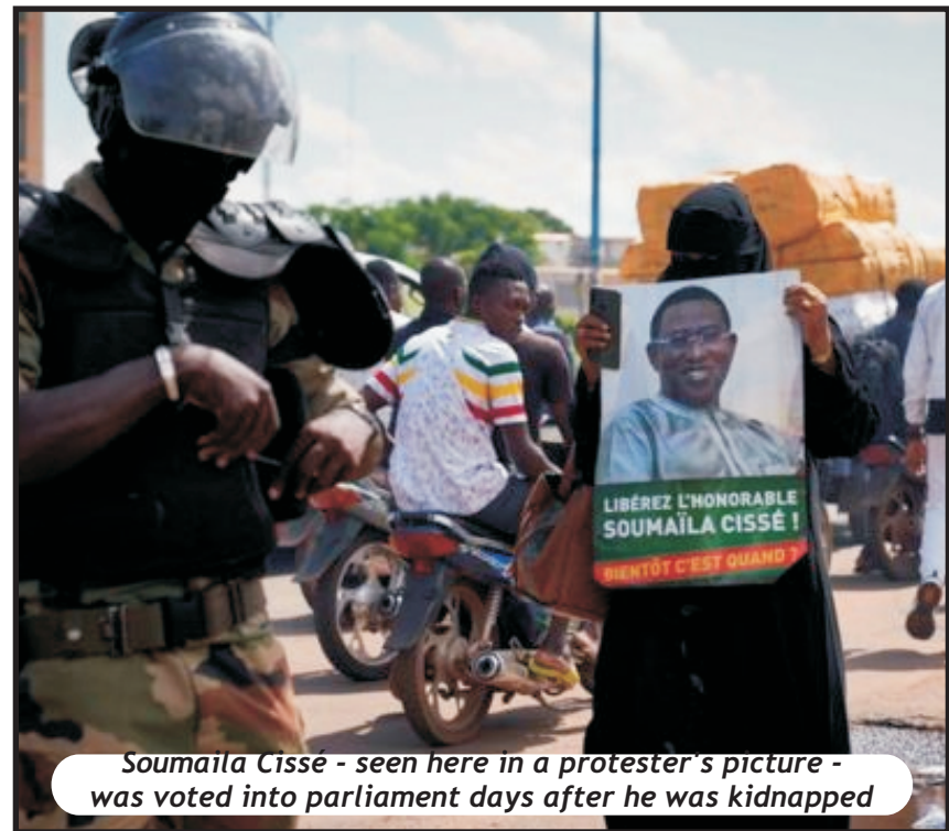
Soumaila Cisse - seen here in a protester's picture - was voted into parliament days after he was kidnapped

Both the UN Human Rights office and the US have warned that the pandemic should not be used to restrict freedoms. BBC