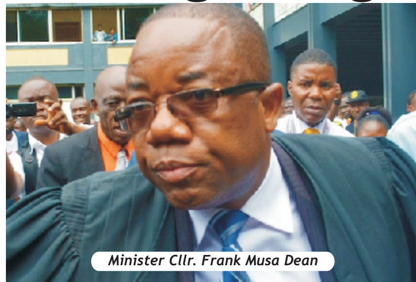
Minister Cllr. Frank Musa Dean

Cllr. Dean, who faced pressure by defense lawyers to testify in the case, has been Liberia's Justice Minister since March 2018, a position he had been serving when the government indicted the officials including the bank's Board of Governors for printing