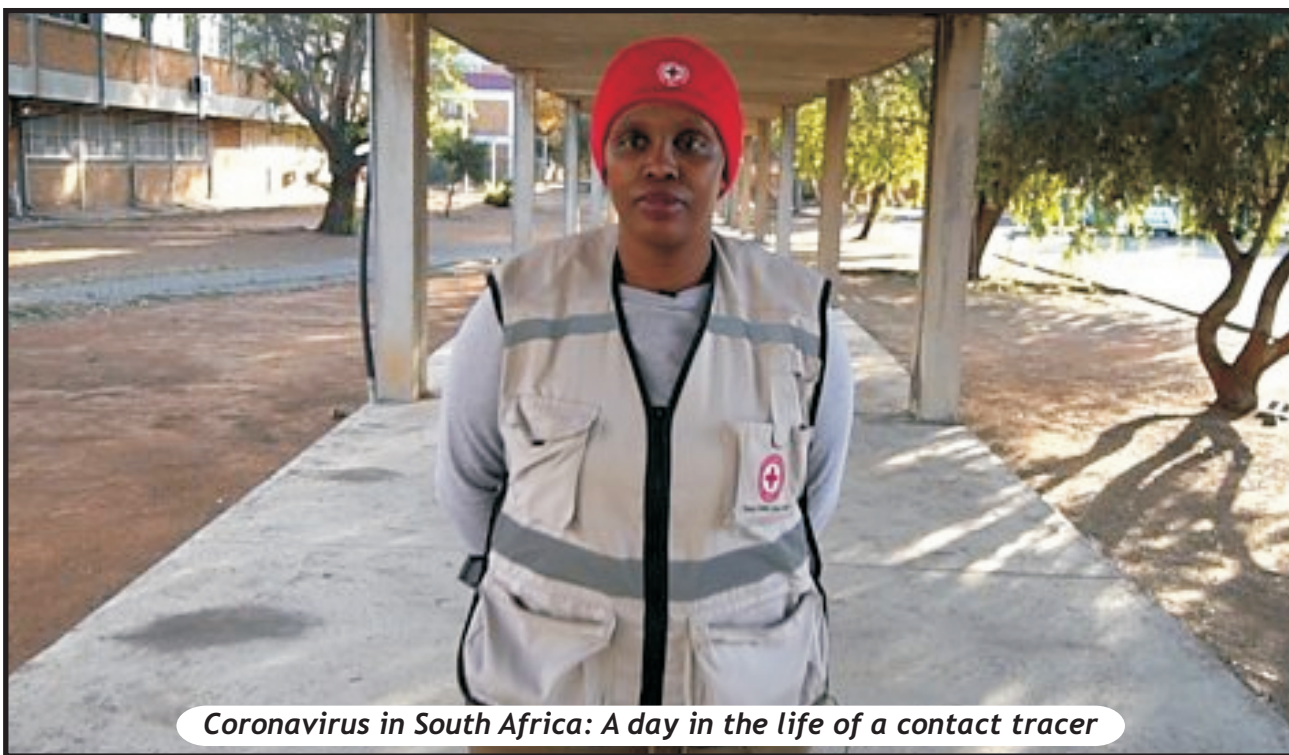
Coronavirus in South Africa: A day in the life of a contact tracer

The WHO says this could be partly because of the relatively young population in Africa - more than 60% are under the age of 25. Covid-19 is known to have a higher mortality rate for older age groups. BBC