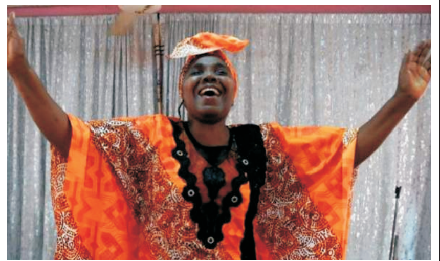
Many religious services have been conducted online in deeply religious Nigeria

Nigeria's commercial hub of Lagos - Africa's biggest city - is to reopen places of worship in the coming week.