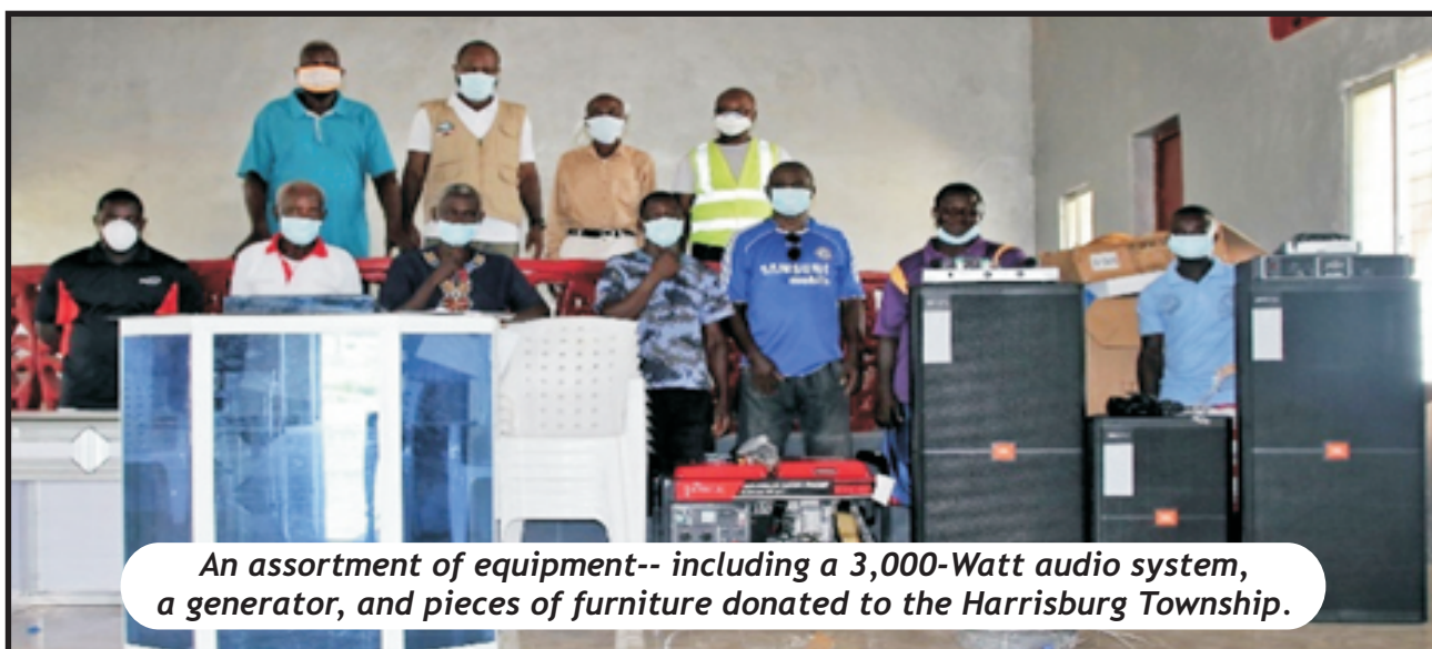
An assortment of equipment-- including a 3,000-Watt audio system, a generator, and pieces of furniture donated to the Harrisburg Township.