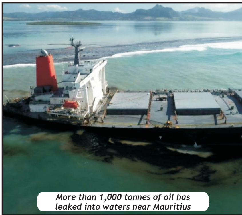
More than 1,000 tonnes of oil has leaked into waters near Mauritius

He vowed that the company would do "everything in their power to resolve the issue". Police in Mauritius say they have been granted a search warrant, allowing them to board the vessel take away items of interest such as the ship's log book in order to help with an investigation. The ship's captain will assist officers with their search. On Friday, Mauritian Prime Minister Pravind Jugnauth declared a state of emergency and appealed for help. BBC