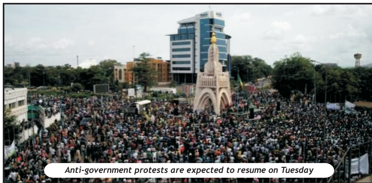
Anti-government protests are expected to resume on Tuesday

Anti-government protests that had taken a break for Eid-al-Adha festivities are to begin again on Tuesday. BBC