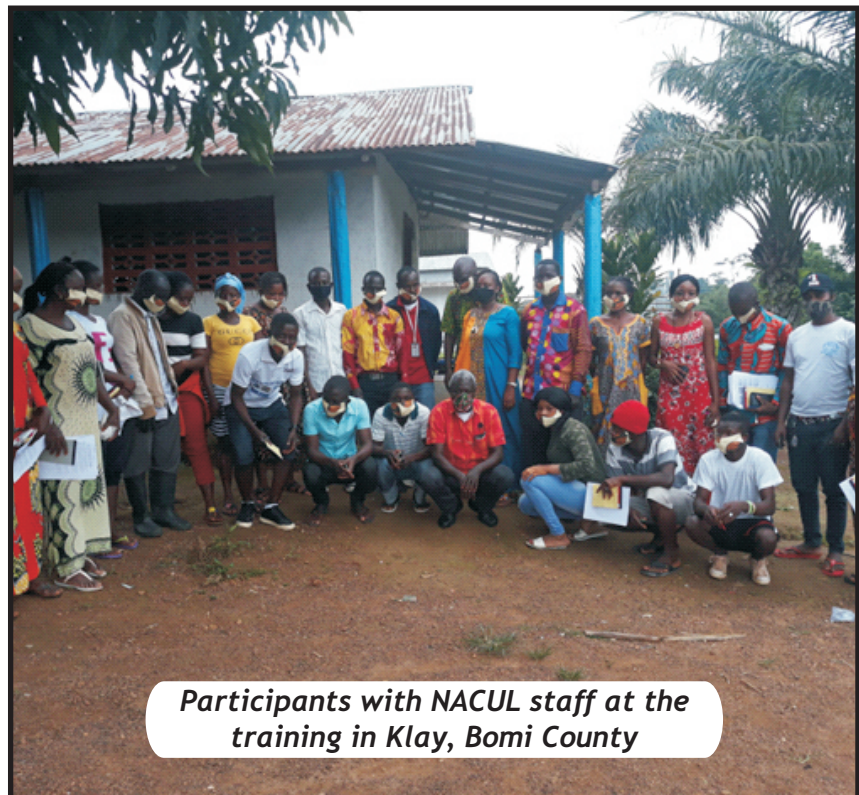
Participants with NACUL staff at the training in Klay, Bomi County

Klay, Bomi County, the EU/FLEGT program-sponsored training brought together leaders and members of the three charcoal burner groups in Bomi County. They include: Suehn/Mecca District