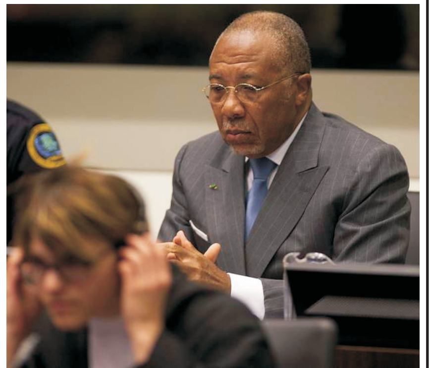
Taylor was sentenced to 50 years in prison by a UN-backed war crimes court

A special court in Sierra Leone has rejected a bid by convicted former Liberian President Charles Taylor to be moved from a British prison citing coronavirus risk, AFP news agency reports.