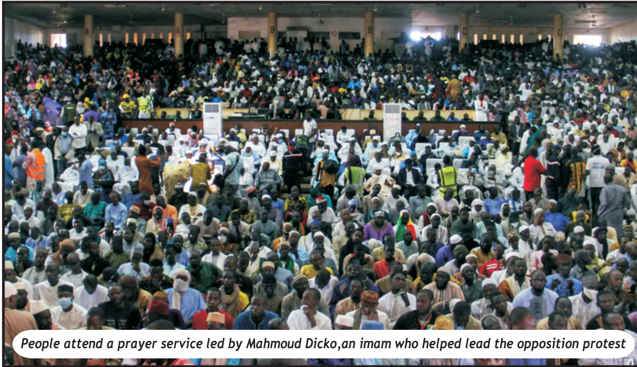
People attend a prayer service led by Mahmoud Dicko, an imam who helped lead the opposition protest

Ousted president Keita has been released and flew to the United Arab Emirates on Saturday for medical treatment after suffering a mini-stroke last week. VOA