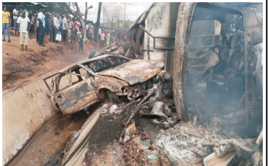
Vehicles and pedestrians were caught up in the inferno

A t least 25 people have been killed in central Nigeria after a fuel tanker exploded following a collision with other vehicles.