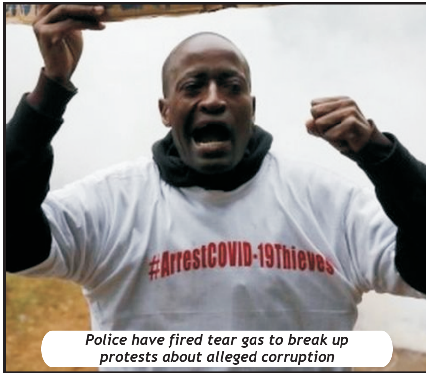
Police have fired tear gas to break up protests about alleged corruption

Wednesday, the EACC said: "Investigations had established criminal culpability on the part of public officials in the purchase and supply of Covid-19 emergency commodities at Kenya Medical Supplies Authority (Kemsa) that led to irregular expenditure of public funds."