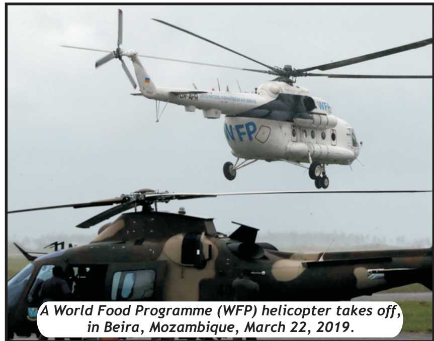
A World Food Programme (WFP) helicopter takes off, in Beira, Mozambique, March 22, 2019.

"When you cut rations, the adults, particularly the mothers in the family—they start skipping meals," said Phiri. "They start reducing the meal portions in order to stretch whatever resources are available for the children to have something...We are also concerned because Cabo Delgado has very high malnutrition rates." BBC