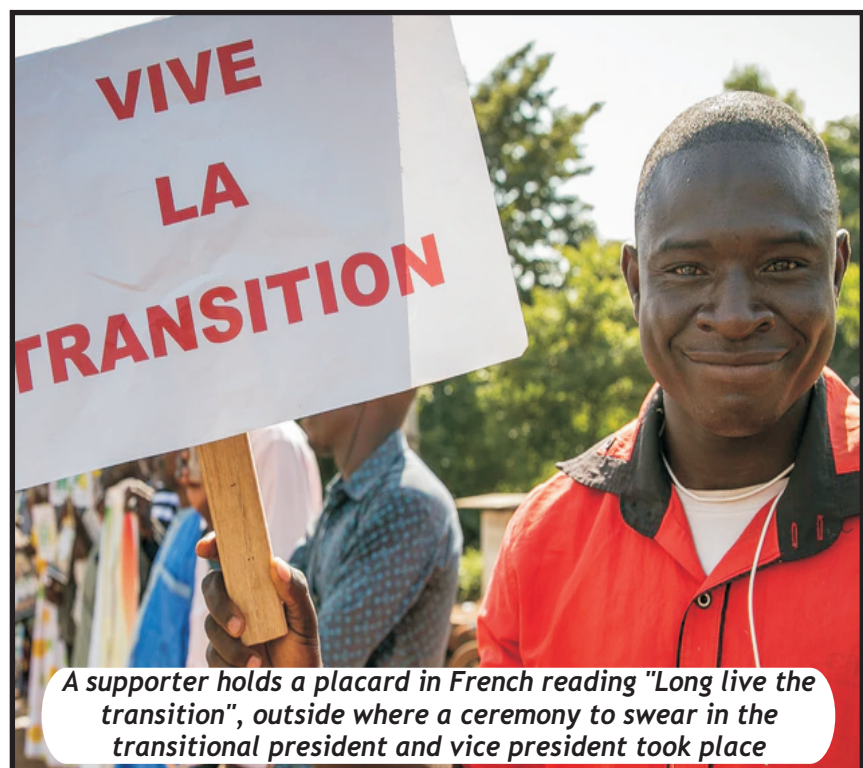
A supporter holds a placard in French reading "Long live the transition", outside where a ceremony to swear in the transitional president and vice president took place

The military has been seeking a three-year transition, to include the writing of a new constitution. VOA