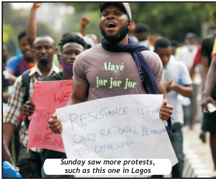
Sunday saw more protests, such as this one in Lagos