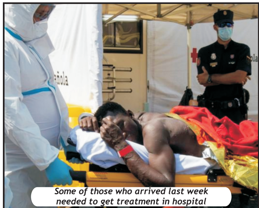
Some of those who arrived last week needed to get treatment in hospital

This year so far, more than 250 people have died trying to reach the islands, the IOM adds. BBC