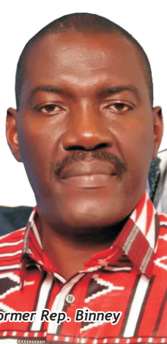
Former Rep. Binney