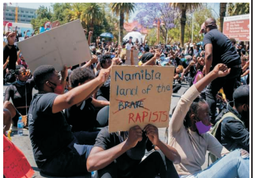
There were also protests in the capital, Windhoek, on Friday

Police in the Namibian capital, Windhoek, have fired teargas and rubber bullets at protesters seeking an end to violence against women.