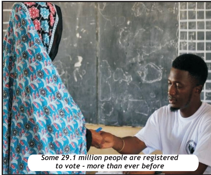
Some 29.1 million people are registered to vote - more than ever before

Zanzibar has a history of contested polls, including in 2015 when they were annulled for not being free and fair. The opposition boycotted the re-run and the ruling CCM party's candidate was declared the winner. BBC