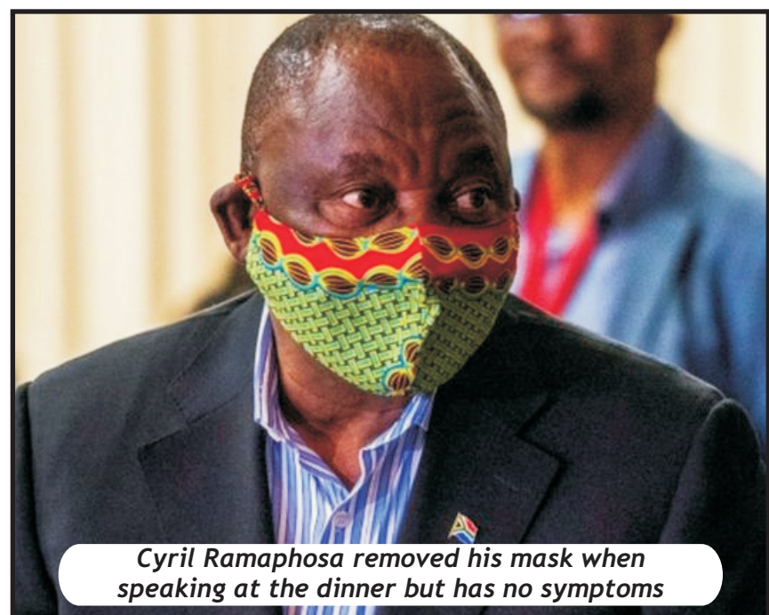
Cyril Ramaphosa removed his mask when speaking at the dinner but has no symptoms

There have been clashes between opposition supporters and security forces across the nation since the opposition leader declared himself winner. BBC