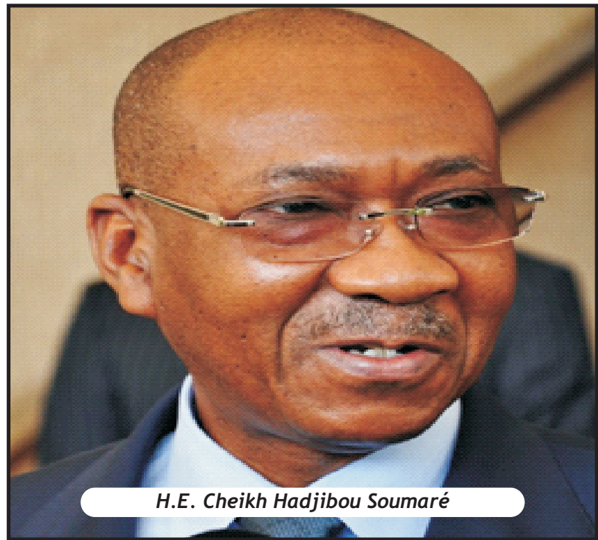
H.E. Cheikh Hadjibou Soumaré

E lection Observers from the Economic Community of West African States (ECOWAS) have arrived Abidjan ahead of the October 31, 2020 Presidential