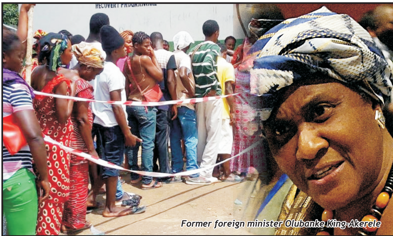
Former foreign minister Olubanke King-Akerele

"The Constitution provides for the people to make decisions but why the government is not listening to its people?"