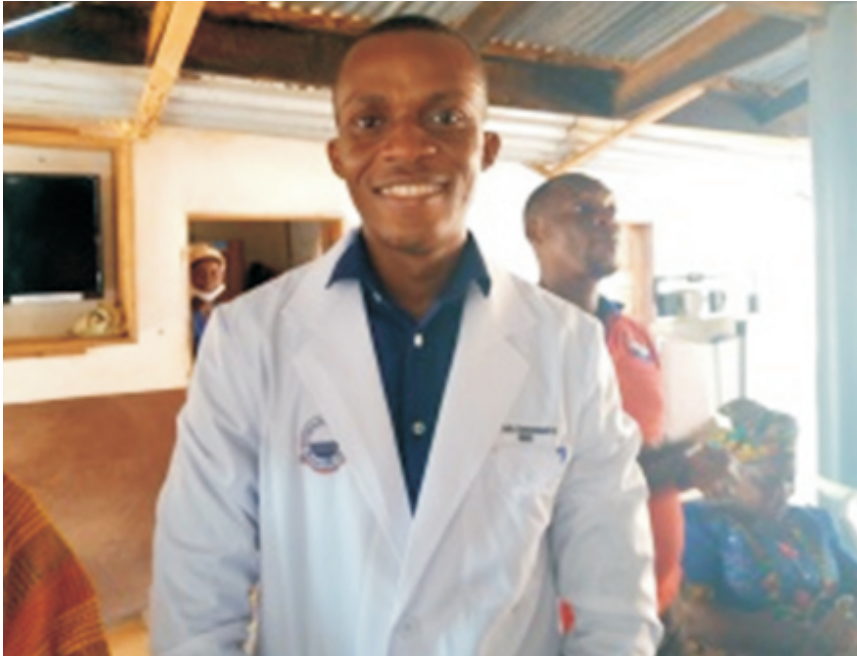
By Roger Akin Than, Nimba County

-appeals for electricity, ambulance, increased allotment