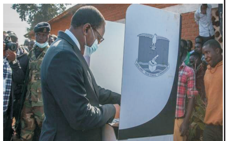
Lazarus Chakwera, seen here voting, was elected in the presidential poll re-run in June

Malawi has been named country of the year for "reviving democracy in an authoritarian region" by the Economist newspaper. The newspaper cites the nullification of the 2019 presidential election results that were marred by irregularities. "The vote-count was rigged with correction fluid on the tally sheets. Foreign observers cynically approved it anyway. Malawians launched mass protests against the 'Tipp-Ex election'. Malawian judges