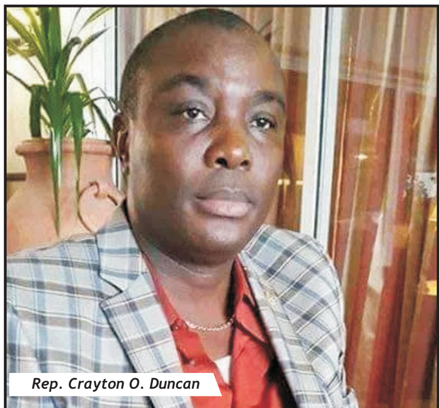
Rep. Crayton O. Duncan