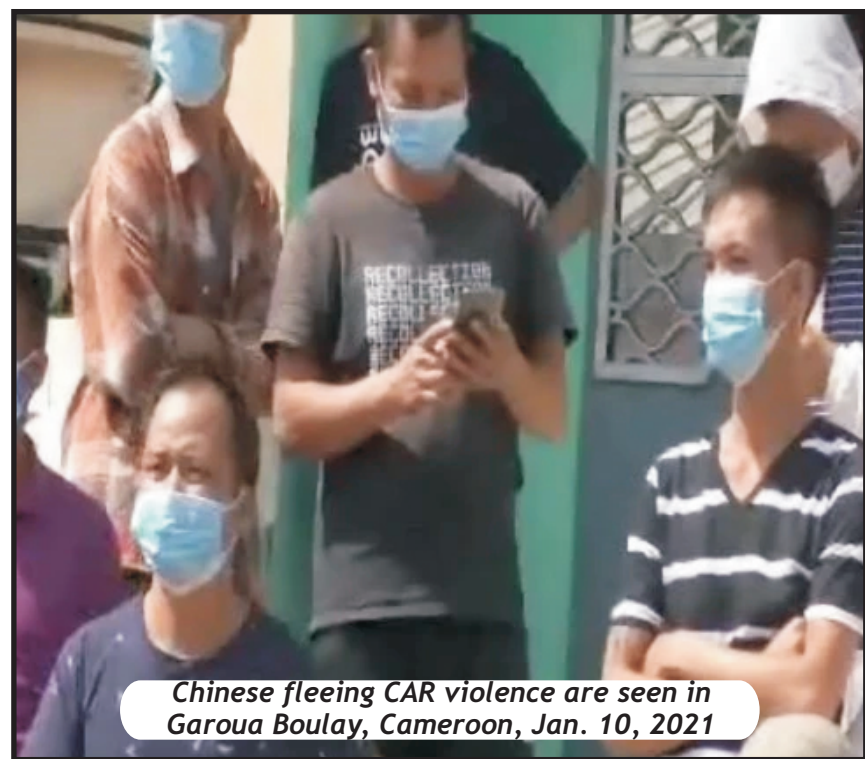
Chinese fleeing CAR violence are seen in Garoua Boulay, Cameroon, Jan. 10, 2021

The United Nations peacekeeping mission in the Central African Republic, MINUSCA, on Sunday said violence was rising to an alarming extent. VOA