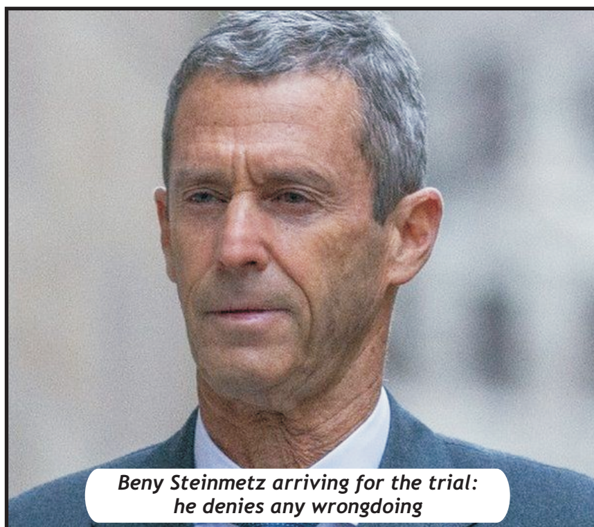
Beny Steinmetz arriving for the trial: he denies any wrongdoing

Guinea's government stripped BSGR of its mining rights in 2014, citing evidence of corruption, which the company denied. BBC