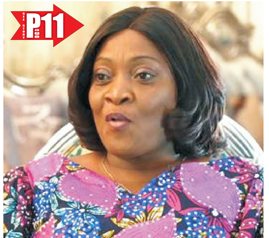
Vice President Jewel Howard Taylor

For as low as 60 USD, you can own one of these!