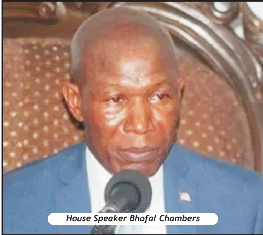
House Speaker Bhofal Chambers