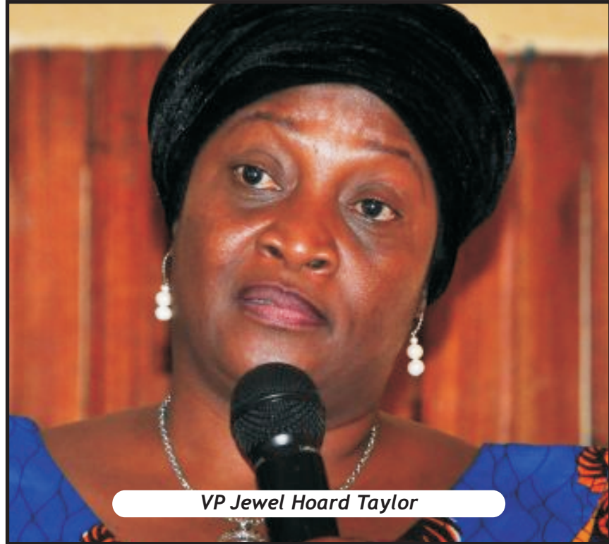
VP Jewel Hoard Taylor

notes that though Liberia is beset by a myriad of issues, ranging from high insecurity, lack of banknotes, high cost of living, a sluggish economy, lack of basic services, distrust, mistrust, allegations and counter allegations on