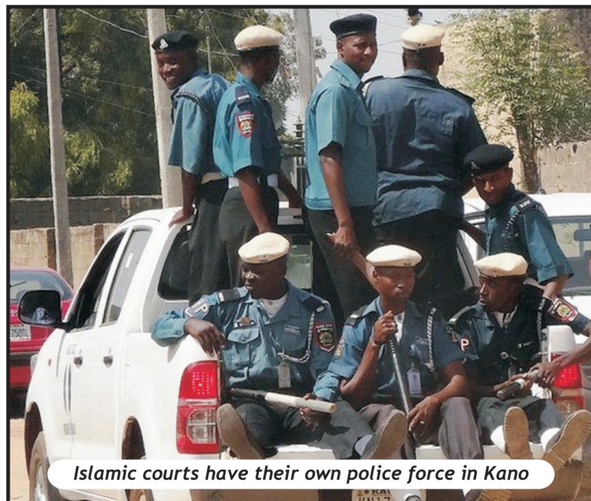
Islamic courts have their own police force in Kano

The appeals court also ordered a retrial in another blasphemy case, involving a singer sentenced to death by the Sharia court for using lyrics deemed blasphemous against the Prophet Muhammad. BBC