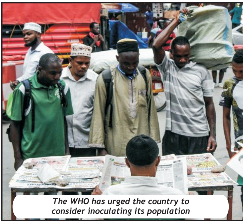
The WHO has urged the country to consider inoculating its population

About 1.2 million front-line health workers would be the first to be inoculated, President Cyril Ramaphosa said. More than 1.4 million people in South Africa have contracted the virus and 44,164 are known to have died, according to Johns Hopkins University research. African states that have started rolling out vaccines include Egypt, Guinea, Morocco and Seychelles. BBC