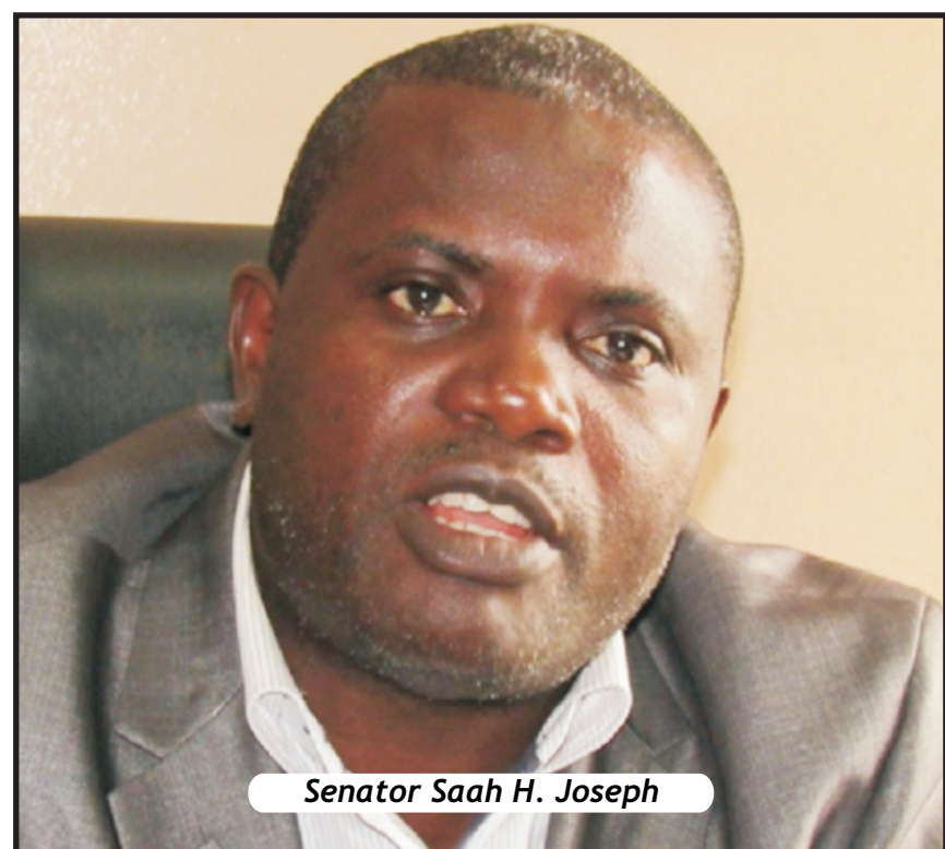
Senator Saah H. Joseph

Meanwhile, it is a standing rule of the senate that when a Bill is brought to the floor for the first time, it can't be sent to any committee until it is reintroduce on the floor for its second reading.