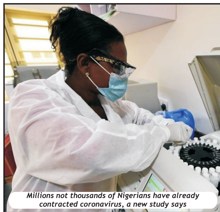
Millions not thousands of Nigerians have already contracted coronavirus, a new study says

"Eighty to ninety per cent of the population in these four states are still susceptible to the virus which makes the vaccination efforts we are about to start in