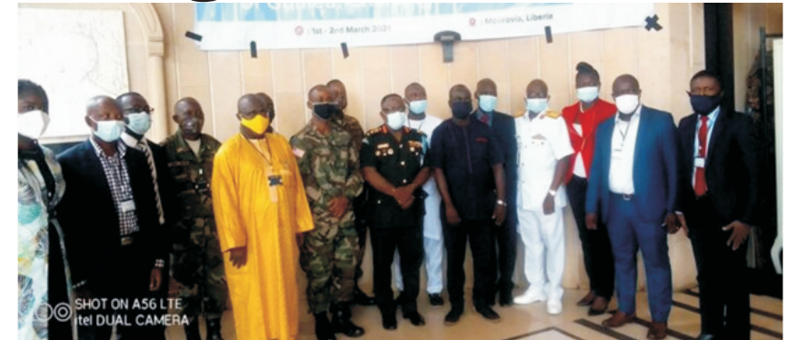
Participants and stakeholders pose for a group photo

The Gulf of Guinea, which serves as a strategic route for regional and international commerce, has contributed in facilitating the growth of the blue economies globally, and has in recent times garnered an ill-repute of a focal point for