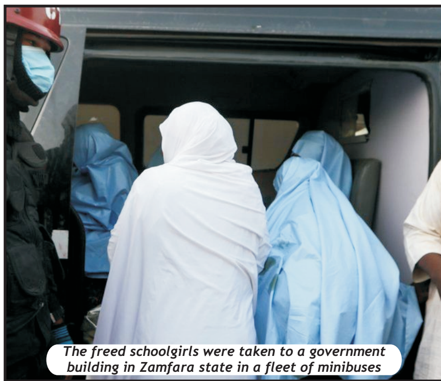
The freed schoolgirls were taken to a government building in Zamfara state in a fleet of minibuses