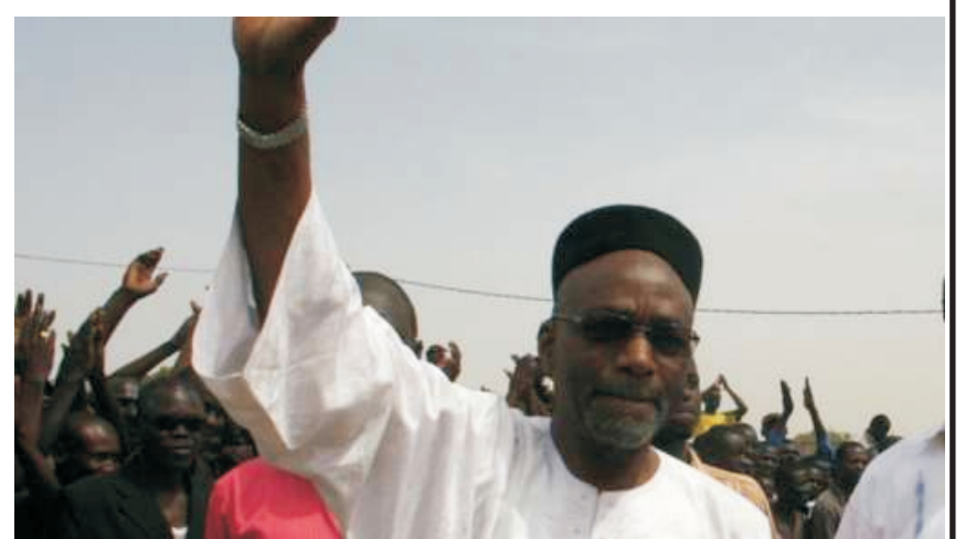
Mr Kebzabo has accused veteran leader Idriss Déby of intimidating rivals

Chad's main opposition candidate Saleh Kebzabo has announced his exit from the presidential election set for 11 April.