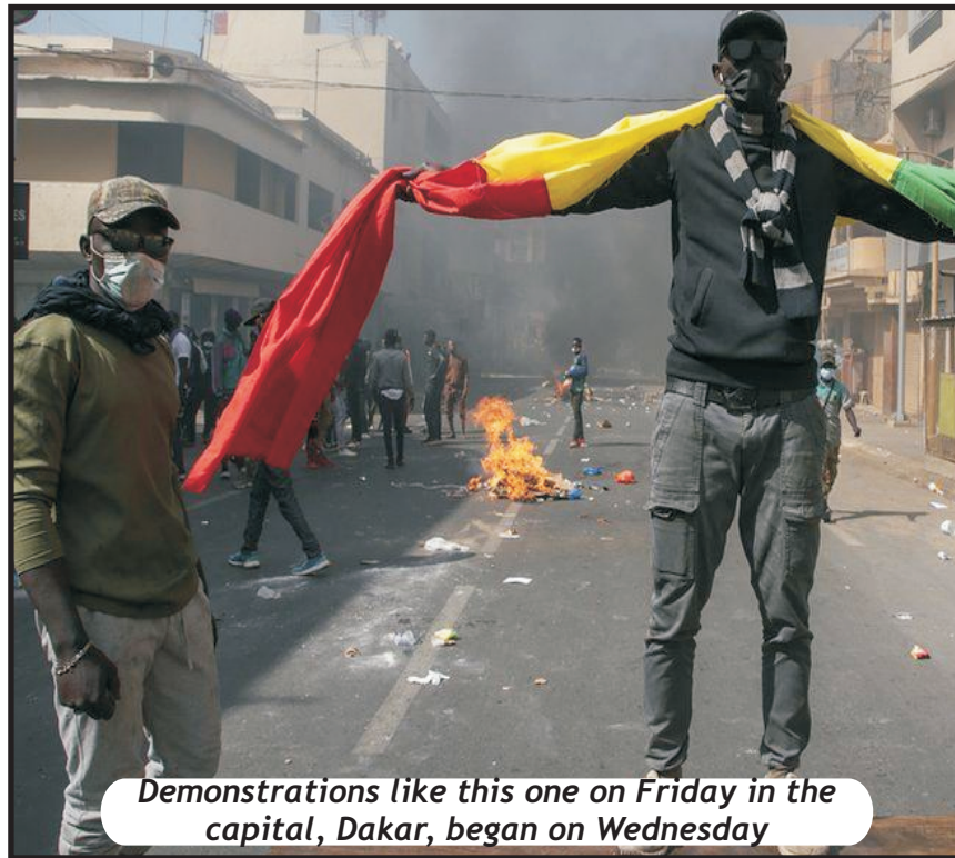
Demonstrations like this one on Friday in the capital, Dakar, began on Wednesday

In 2014 he founded his own political party, Pastef-Les Patriotes, and came third in the 2019 presidential election with 15% of the vote. BBC