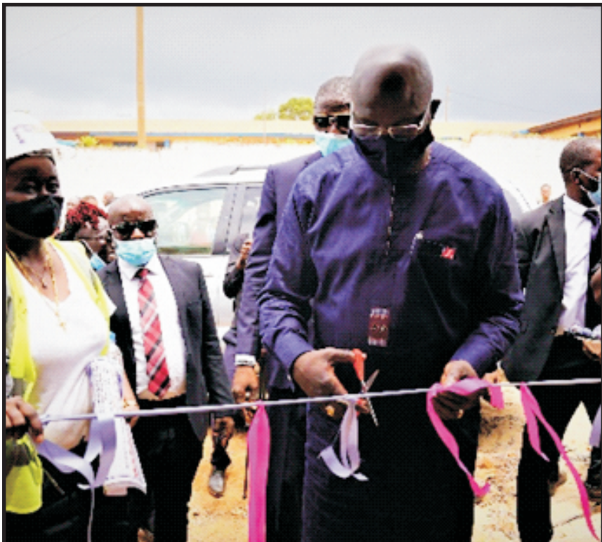
"Light up Monrovia" Project.

The Peace Island is one of Monrovia's largest squatters communities located behind the Ministerial Complex and home to mainly retired former soldiers of the Armed Forces of Liberia.