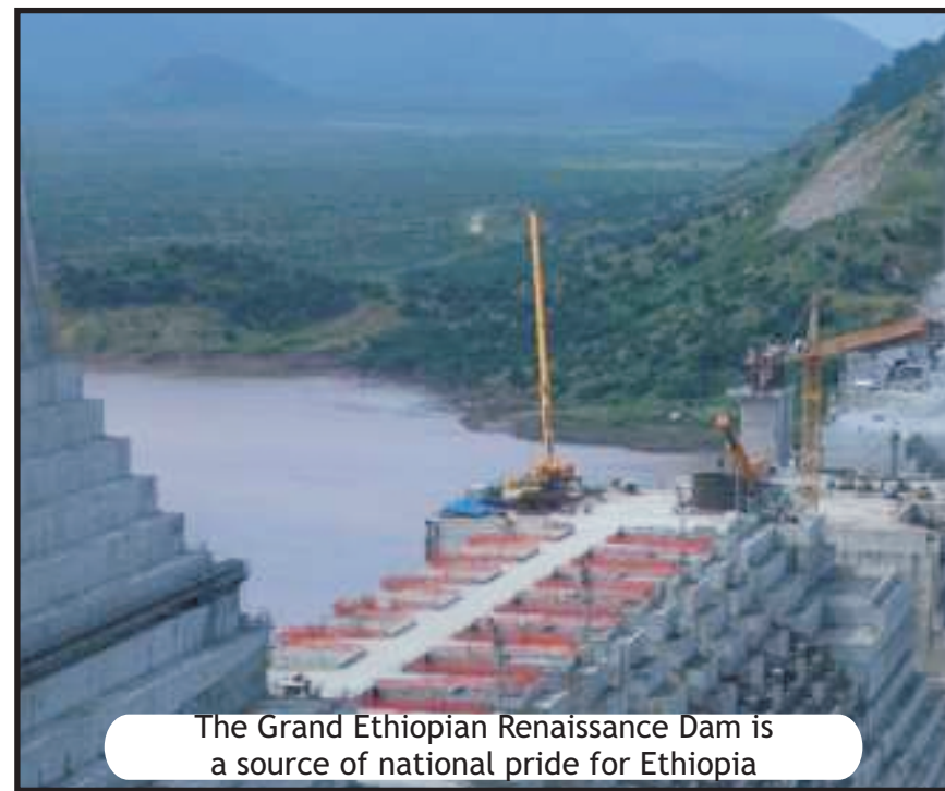
The Grand Ethiopian Renaissance Dam is a source of national pride for Ethiopia

While Ethiopia says it is willing to keep talking, it wants to stick to the dialogue organised by the African Union and does not want to involve these additional international mediators. So for now the dispute rumbles on. Egypt has long opposed the construction of the dam because it relies so heavily on the water from the Nile. It's possible that Sudan could benefit from it though - experts say there would be less flooding and Sudan could