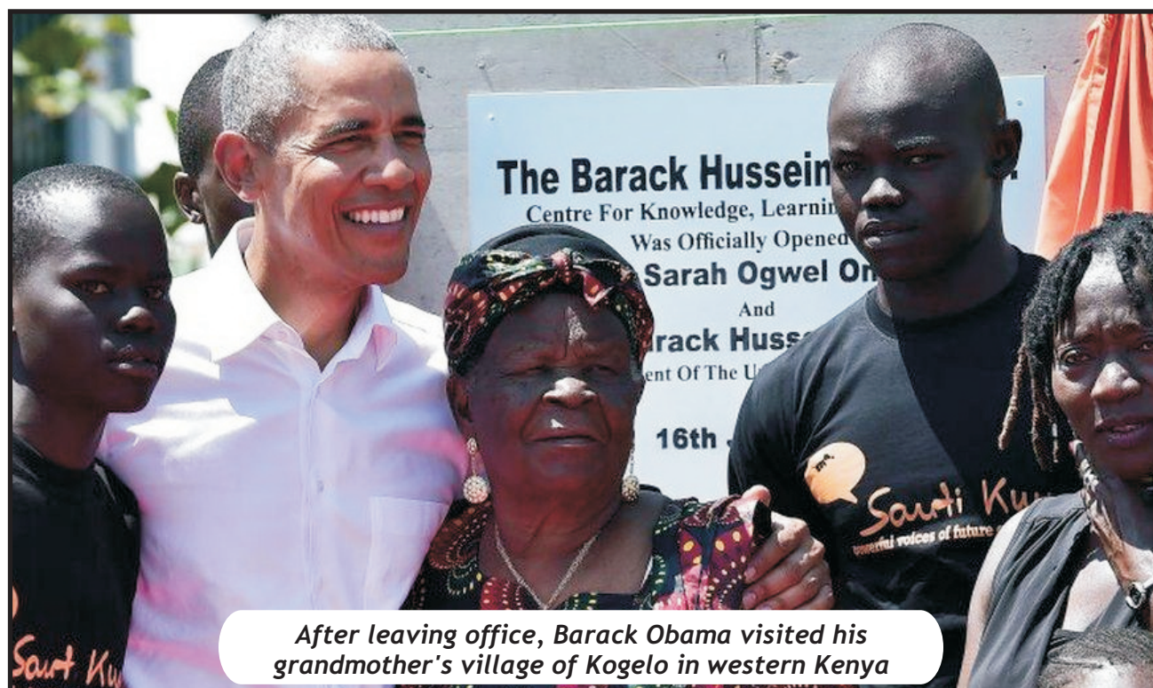
After leaving office, Barack Obama visited his grandmother's village of Kogelo in western Kenya

Her husband, who died in 1975, fought for the British in Burma, now called Myanmar, and is reported to be the first man in his village to swap goatskin clothing for trousers. BBC