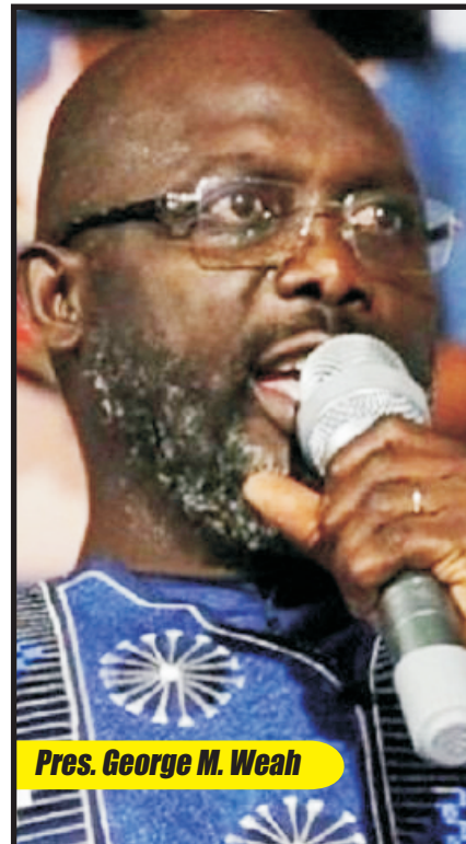
Pres. George M. Weah

President Weah questioned what would be his achievement, which he could not accomplish when he was in power for 12 years. The tour of the county continues today with more town hall meetings.