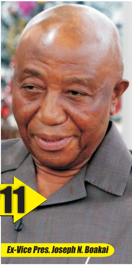
Ex-Vice Pres. Joseph N. Boakai