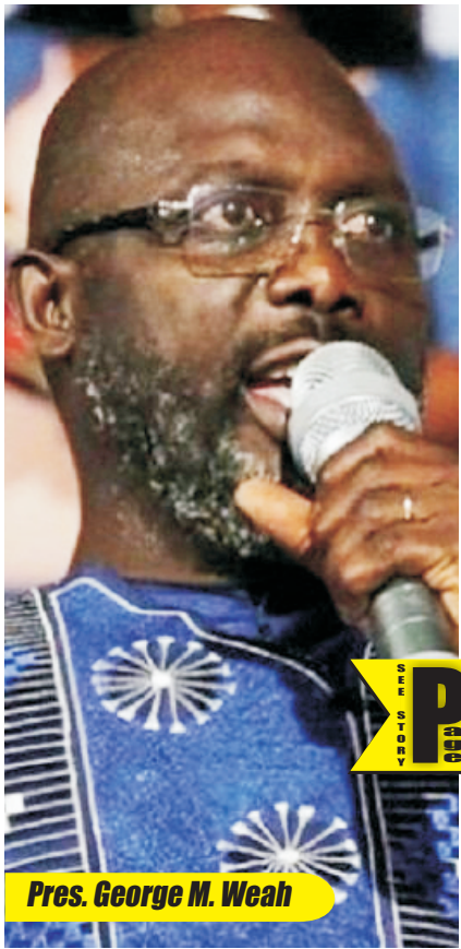
Pres. George M. Weah