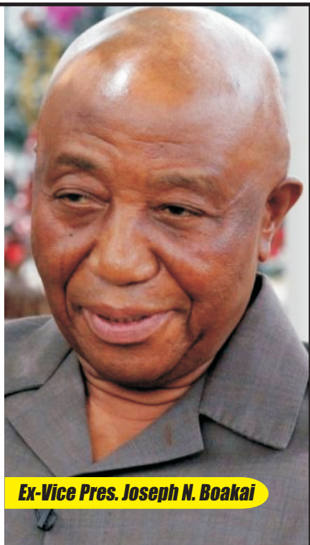
Ex-Vice Pres. Joseph N. Boakai

Democratic Change (CDC) government as mere sidewalk, thereby questioning its economic impact.