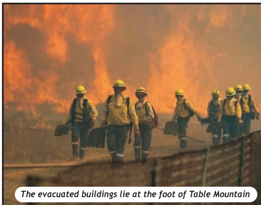
The evacuated buildings lie at the foot of Table Mountain

The library's fire doors closed automatically. This prevented the fire from spreading and may have saved more archives held in the basement, including records of the campaign against white minority rule in South Africa. The historic Mostert's Mill was also destroyed. It was built in 1796, and was the oldest surviving windmill in South Africa. Residents in the area have been warned of smoke and soot in the air, and told to keep windows and doors closed. Meanwhile hikers in the Table Mountain National Park have been urged to leave and drivers who have parked in the area have been told to collect their vehicles.