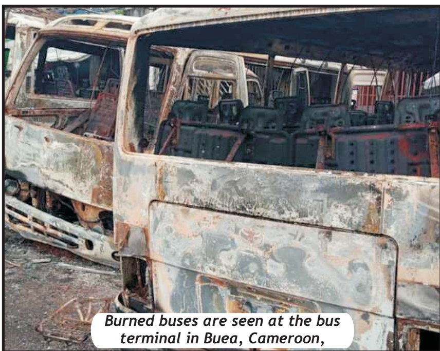
Burned buses are seen at the bus terminal in Buea, Cameroon,

Last year during Eid al-Adha, Cameroon restricted prayers and festivities that brought together more than 10 people. Thousands of Muslims in the capital Yaoundé defied the restrictions, ordered as part of measures to stop the spread of COVID-19. This year, many came with face masks but did not respect the at least one meter distance from each person as instructed by the government. VOA