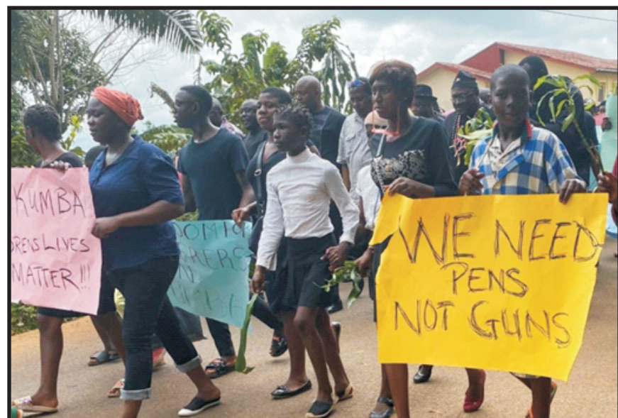
Schoolchildren, their parents and teachers hold a protest after gunmen opened fire at a school in Kumba

The Ethiopian government has rejected the suggestion that a shortage of fuel is impeding movement of lorries. It has also accused aid organisations of supporting the TPLF, a group it had labelled as "terrorist". BBC