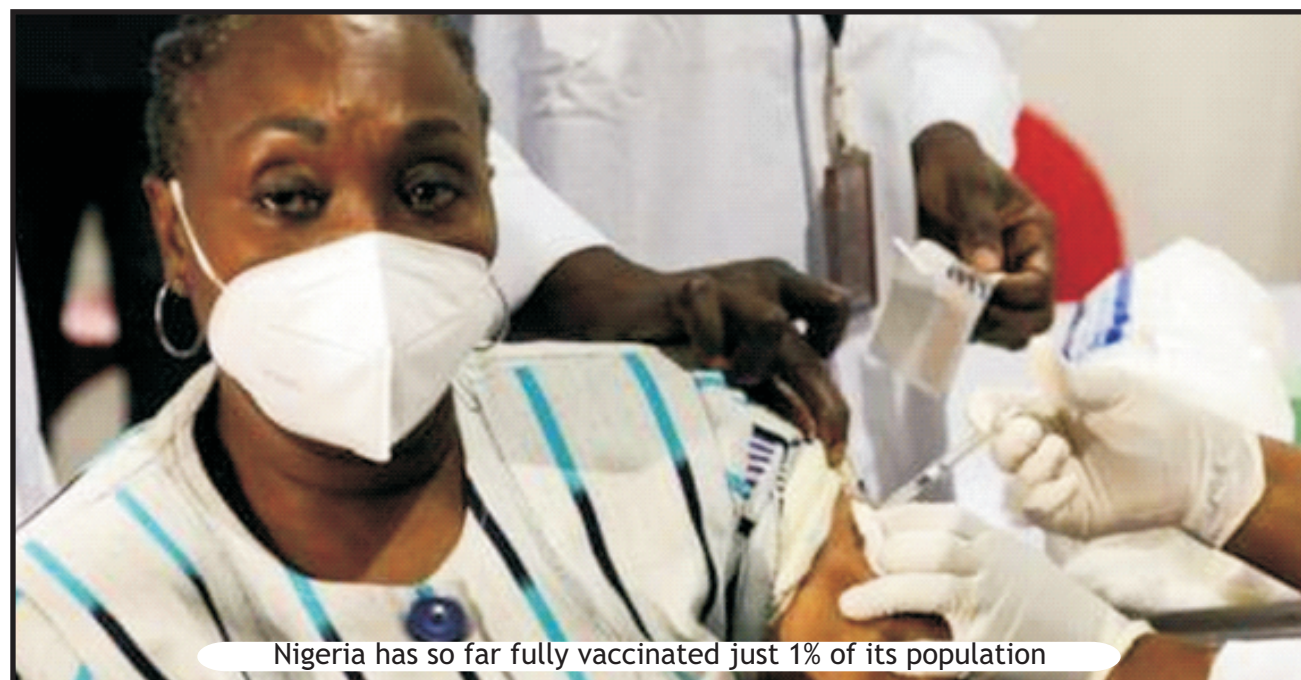
Nigeria has so far fully vaccinated just 1% of its population

The ban was imposed in May following a spike in Covid-19 cases in those countries. BBC