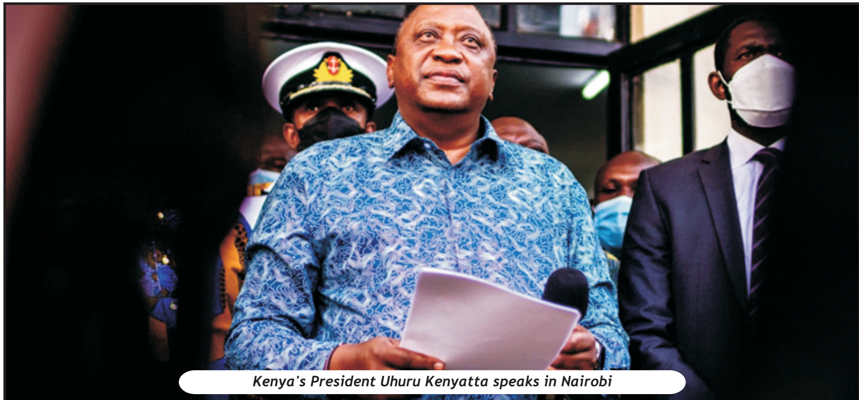
Kenya's President Uhuru Kenyatta speaks in Nairobi

That is expected to include revelations about the offshore holdings of Kenyatta and his family. The International Consortium of Investigative Journalists said in recent reports about the Pandora Papers that Kenyatta's family had stowed away about $30 million in offshore wealth. There is no evidence that the Kenyatta family stole any state assets.