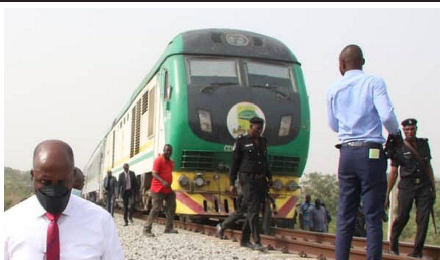
Train travel is pricier but passengers wanting to avoid the dangerous Abuja-to-Kaduna highway had little choice

Photos have been released of 62 people allegedly being held hostage in Nigeria after a brazen attack by gunmen on a high-speed train last month.