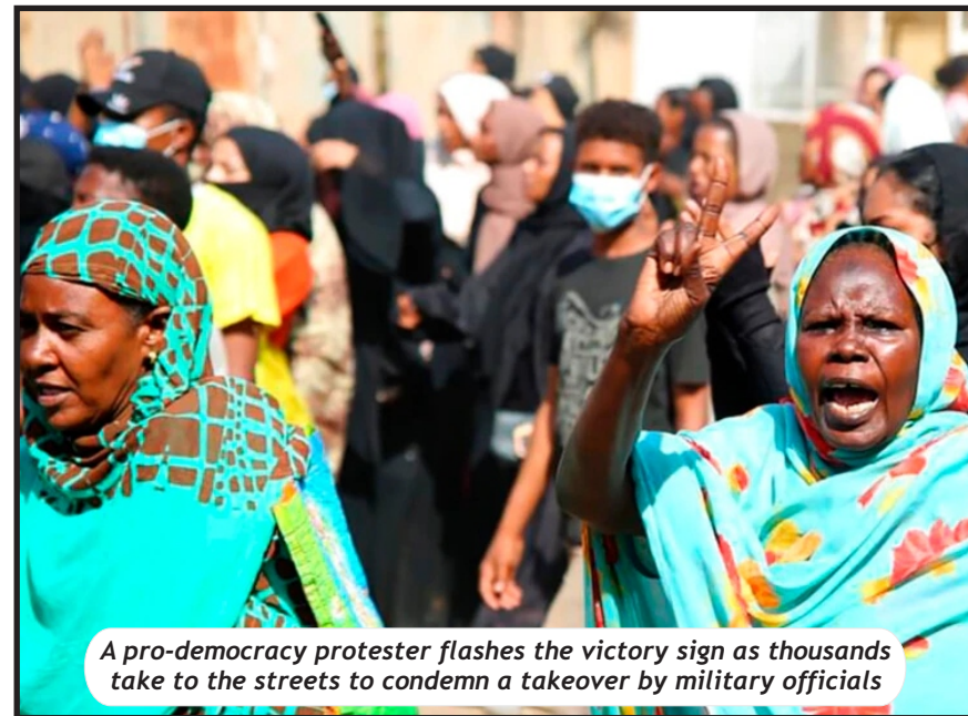
A pro-democracy protester flashes the victory sign as thousands take to the streets to condemn a takeover by military officials

The Criminal Court in northern Khartoum rejected the prosecutors' request to renew their detention pending investigation into an array of vague charges, including betrayal of public