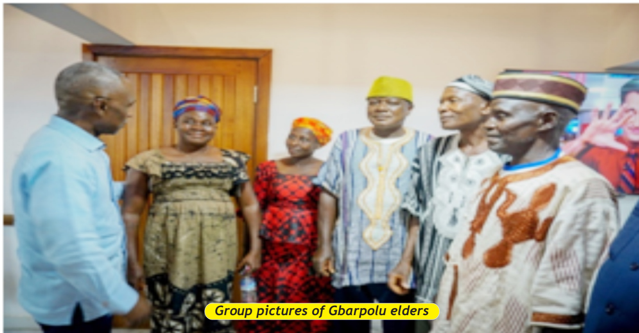
Group pictures of Gbarpolu elders

A delegation of opinion leaders, from Gbarpolu County, Thursday, April 28 paid a courtesy call on the Political Leader of the Alternative National Congress (ANC), Mr. Alexander Cummings in Monrovia.