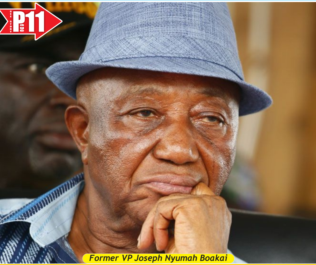
Former VP Joseph Nyumah Boakai