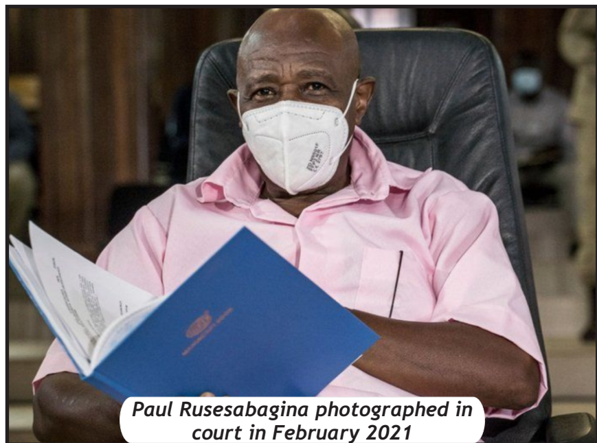
Paul Rusesabagina photographed in court in February 2021

The following year he was awarded the Presidential Medal of Freedom by then-US President George W Bush for his efforts. But Rusesabagina's journey from celebrated