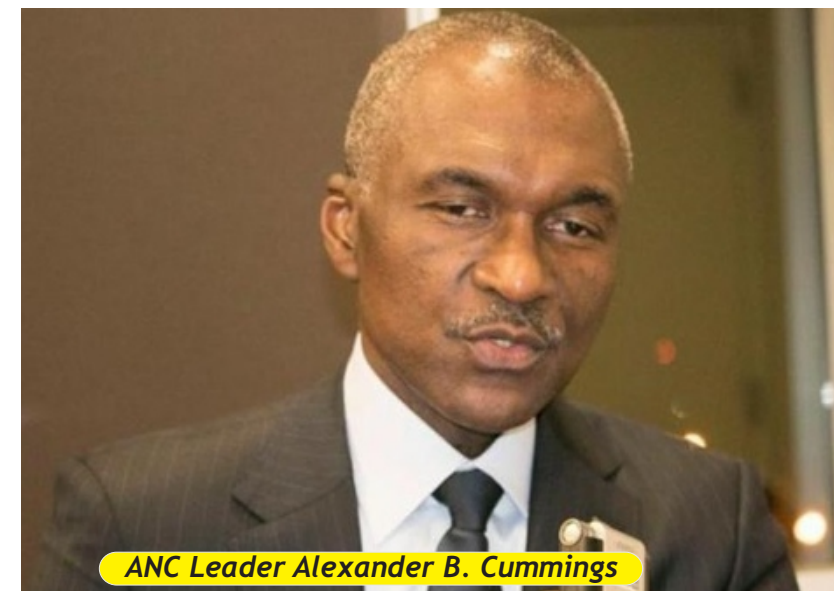
ANC Leader Alexander B. Cummings

corruption in both the public and private sector.