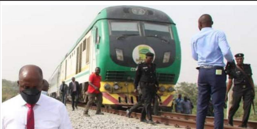
Train travel is deemed safer by passengers travelling from Abuja to Kaduna

Dozens of passengers kidnapped on a high-speed train in northern Nigeria are being used as human shields by their abductors, making their rescue difficult, President Muhammadu Buhari said on Monday.