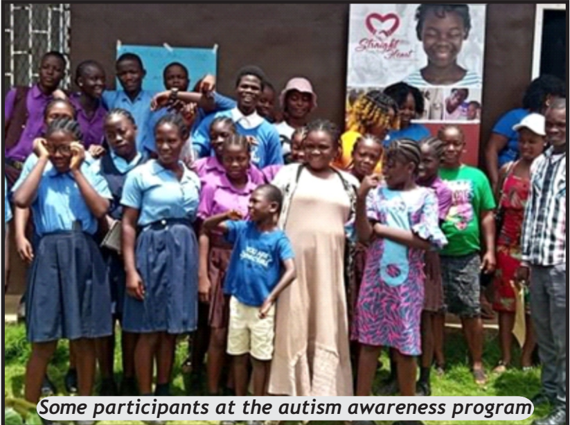
Some participants at the autism awareness program

department of Mental Health, Ministry of Health congratulated Straight from the Heart International for