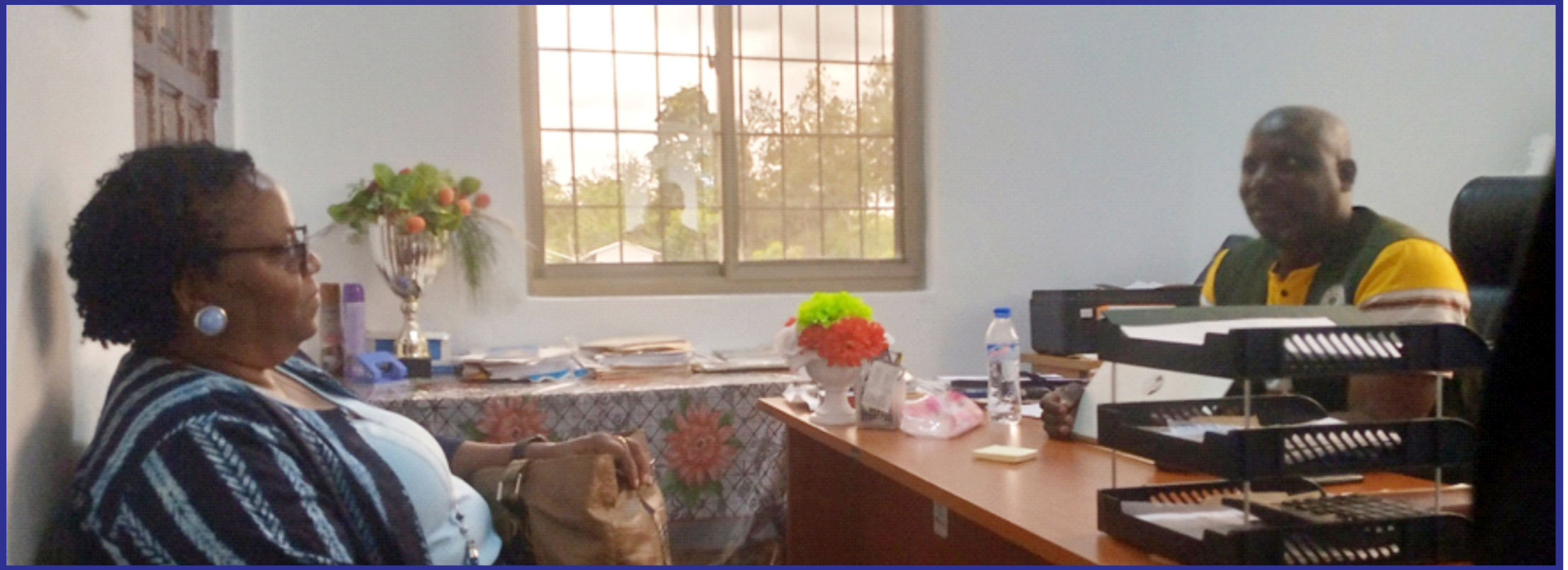
Amb. Wesseh in conversation with ED Gamys