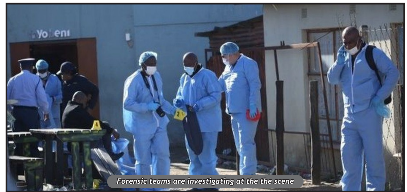
Forensic teams are investigating at the the scene

Champion over 800m at both the 2012 and 2016 Olympic Games, Semenya has previously challenged World Athletics' rules but lost her case at the Court of Arbitration for Sport in 2019. BBC