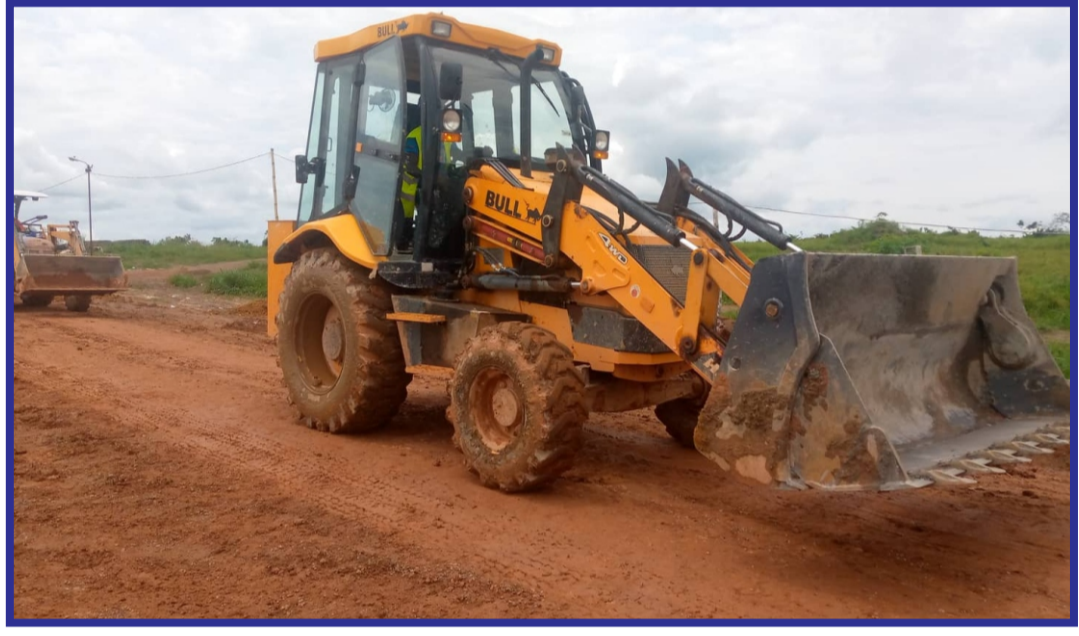
Bulldozers at work