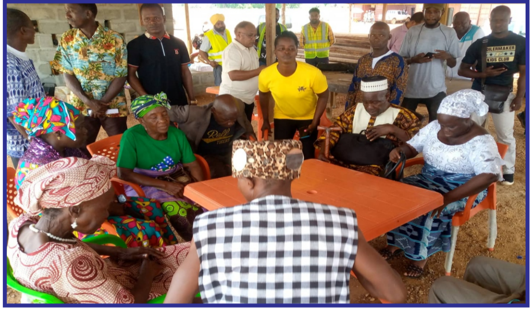
Traditional elders in a roundtable