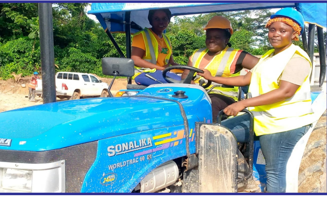
Female workers at the Jeety Rubber LLC.