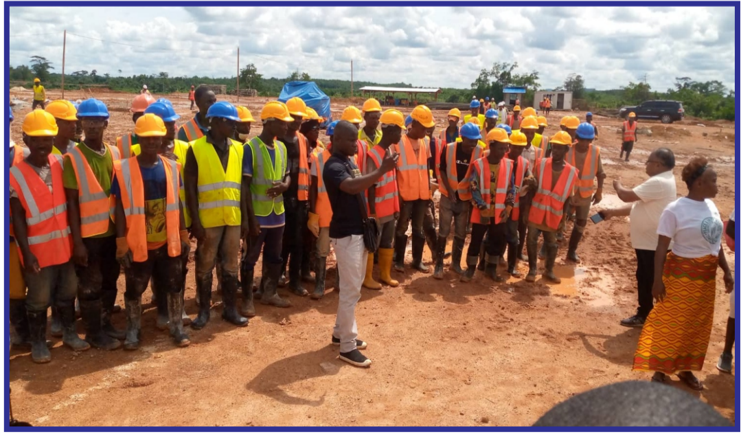
Employees of Jeety Rubber LLC.