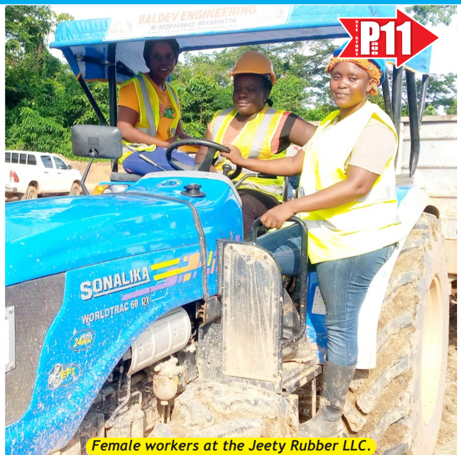
Female workers at the Jeety Rubber LLC.

Jeety Tyre Factory attracts female tractor drivers