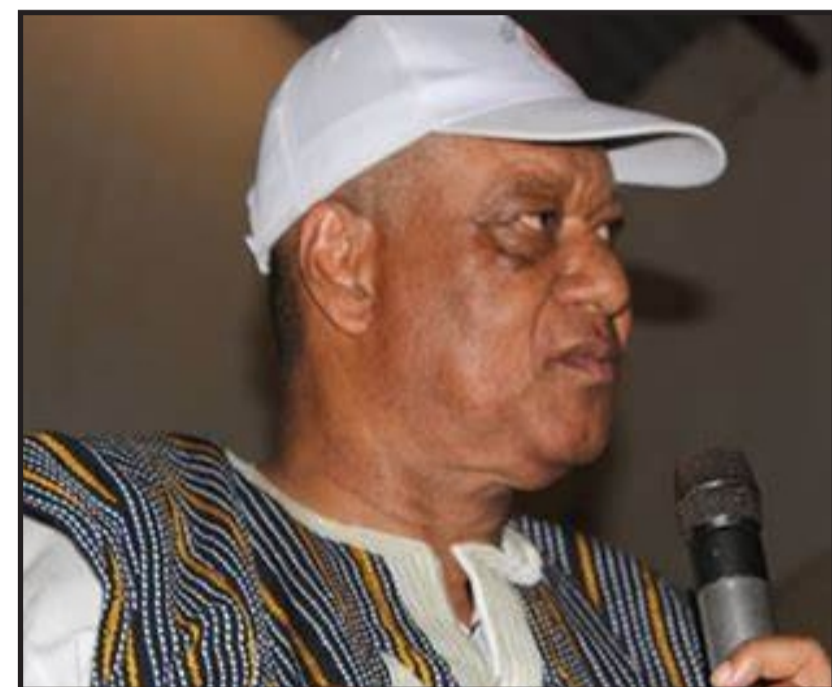
Amb. Joseph Nyumah Boakai.