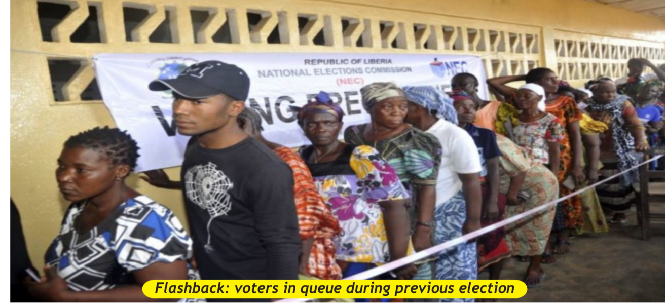
Flashback: voters in queue during previous election

The National Elections Commission (NEC), is expected to host a one-day Interaction session today Monday June 27, with the Six candidates contesting in the Lofa County Senatorial By-election, slated for Tuesday, 28 June 2022, in Voinjama City. The interaction with the Lofa by-election candidates, other electoral stakeholders, and policy makers of the Commission, will largely