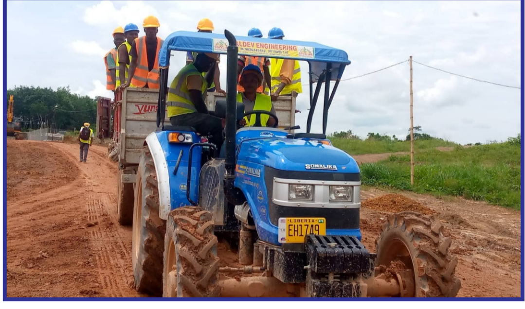
Employees heading for work