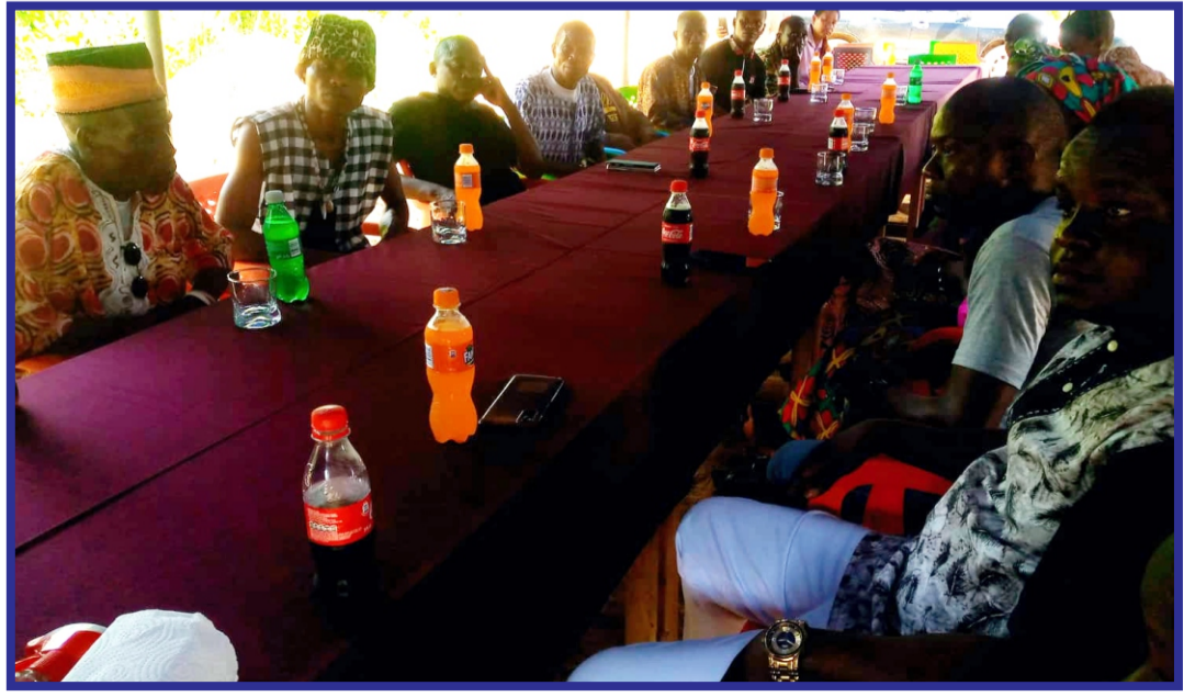
Elders being entertained