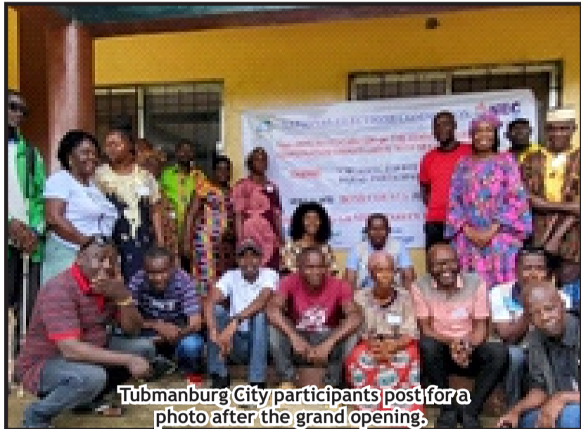
Tubmanburg City participants post for a photo after the grand opening.

Nearly 75 key stakeholders and representatives in Bomi county, including Persons Living with Disabilities, Women Civil Society groups, to include, Women Community based organizations, the National Union on Disabilities (NUOD), County Gender Coordinators as well as Assistant Elections Magistrates of the Commission are attending the program. Press Release