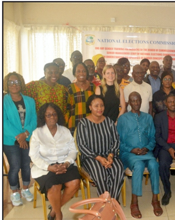
BOC members, partners, UNDP, and UN Women post for the Monrovia Photo at a local hotel.