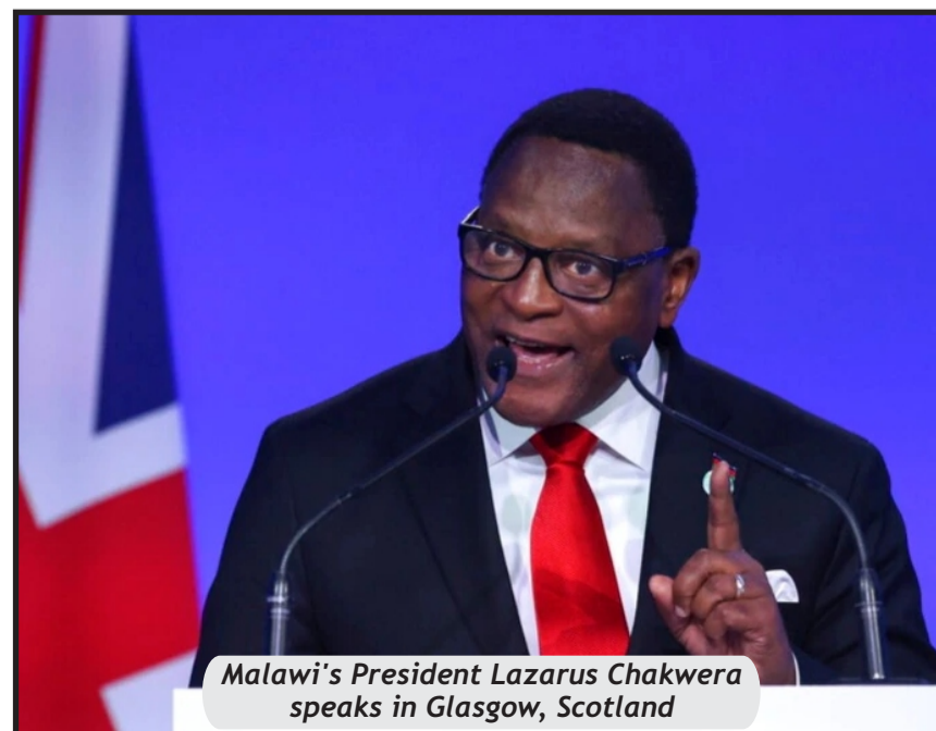
Malawi's President Lazarus Chakwera speaks in Glasgow, Scotland

Also, the business community pledged to name and shame businesses and