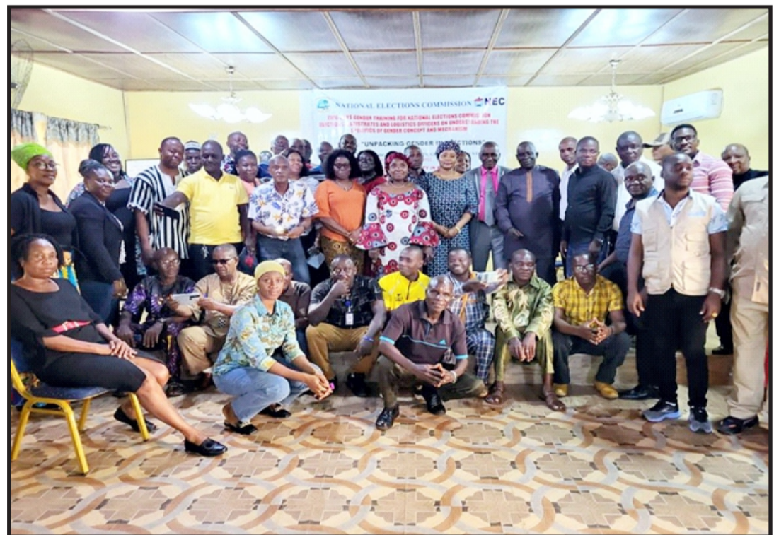
A group photo after the grand opening of the NEC/UNDP and partners training in Grand Bassa County.