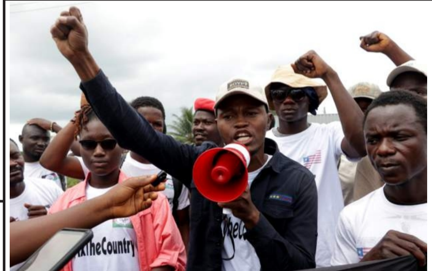
The allegations of violence against students at the protest has sparked outrage

U niversity students have been injured in Liberia after their protest against the high cost of living was allegedly disrupted by supporters of the ruling party - the Congress for Democratic Change (CDC).