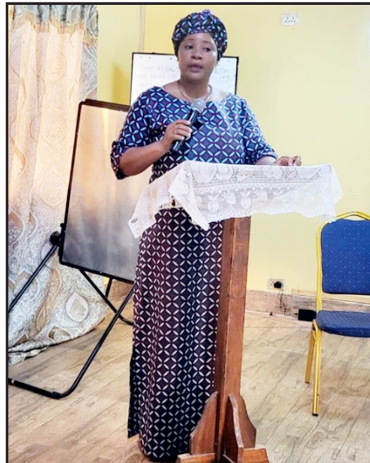
NEC Commissioner with oversight for Gender, Hon. Josephine Kou Gaye speaks in Buchanan.