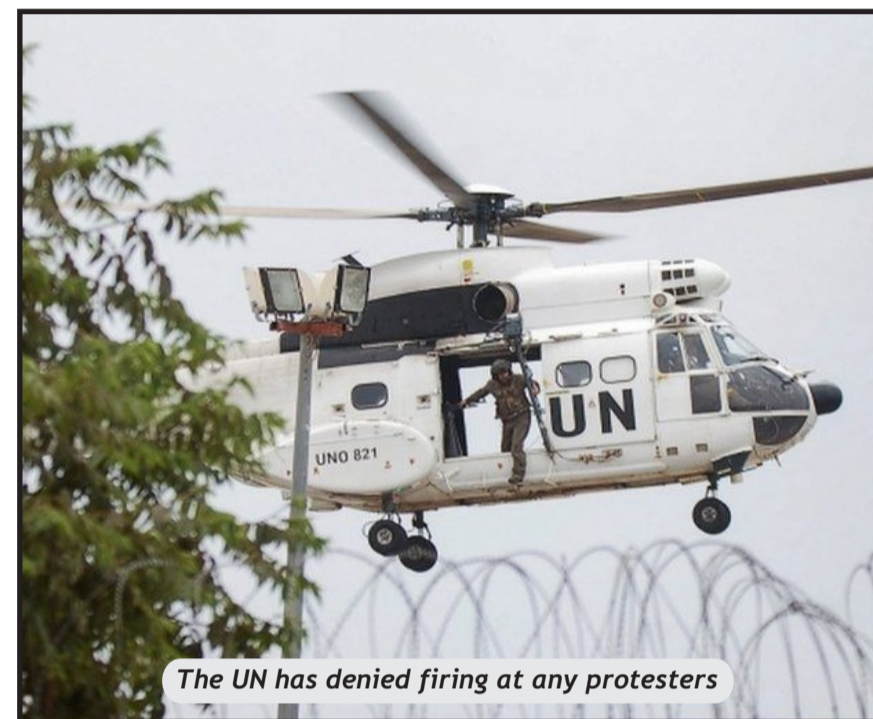
The UN has denied firing at any protesters

At least 17 people including three members of