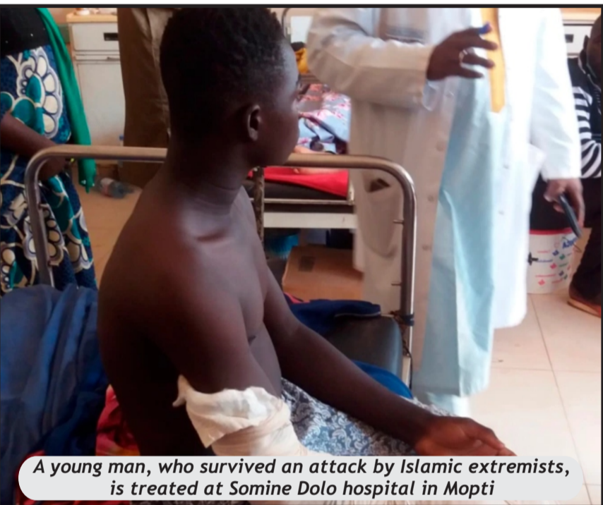
A young man, who survived an attack by Islamic extremists, is treated at Somine Dolo hospital in Mopti

B AMAKO, MALI — Mali's military government says coordinated insurgent attacks on Wednesday killed 15 troops and three civilians, while leaving scores of militants dead. Analysts say the attacks