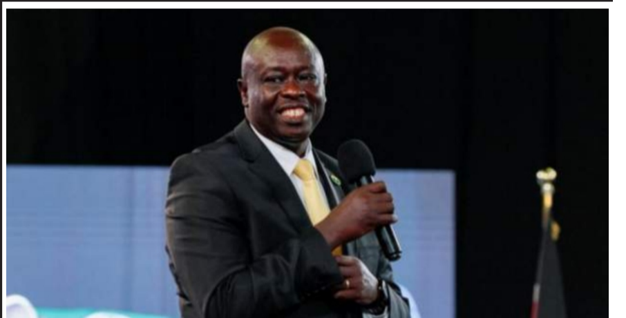
Rigathi Gachagua says he will appeal the judgement

The running mate of leading Kenyan presidential candidate William Ruto has lost $1.7m (£1.4m) after a court ruled that the money held in four accounts at a local bank came from proceeds of corruption.