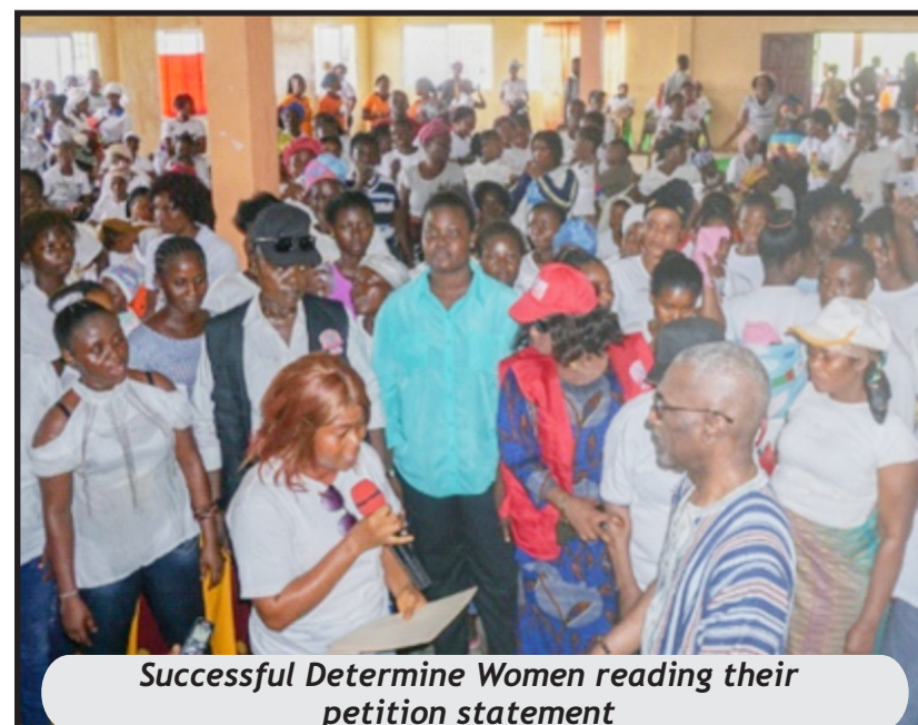
Successful Determine Women reading their petition statement

So far six schools have been covered with more schools expected to meet the criteria to benefit from the scheme in the future.