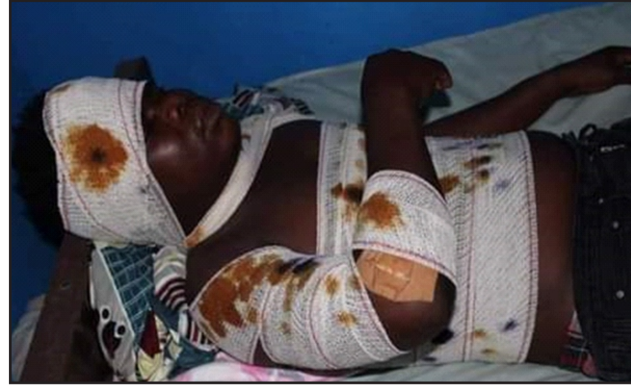
Independence Day, 26 July 2022.