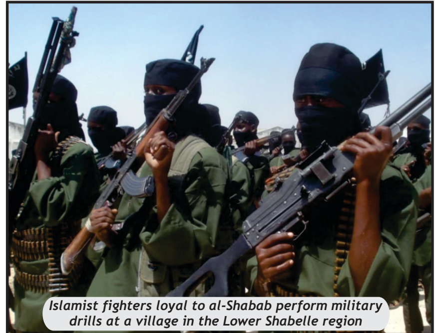
Islamist fighters loyal to al-Shabab perform military drills at a village in the Lower Shabelle region

"It's only been less than a year ago that al-Shabab emir [Ahmed] Diriye called for an increased emphasis on external attacks and increased emphasis on