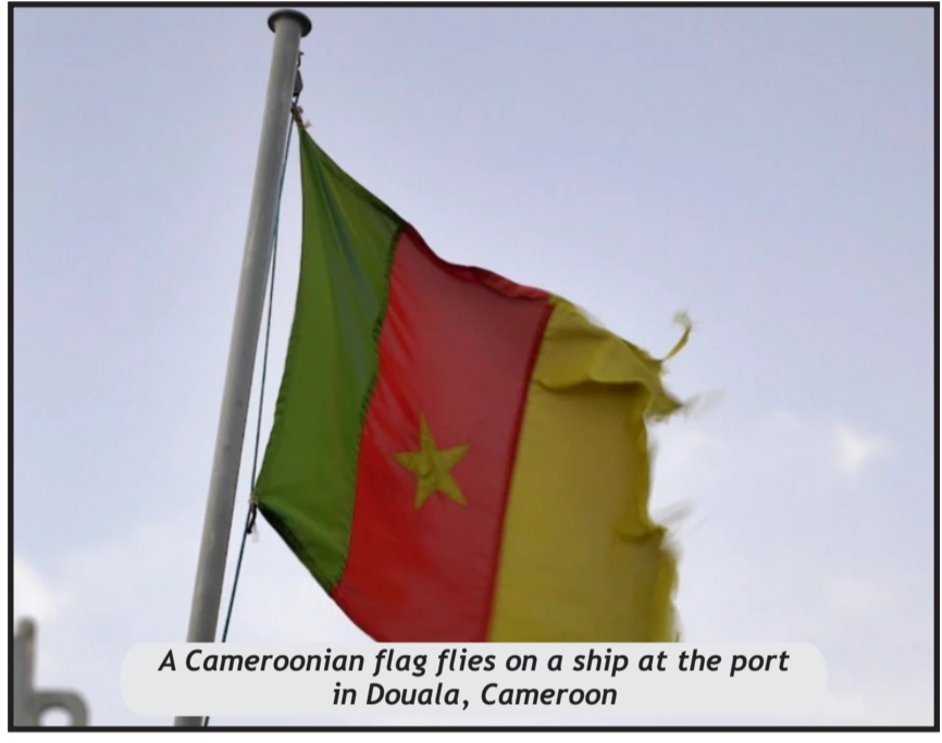
A Cameroonian flag flies on a ship at the port in Douala, Cameroon

That secrecy, the experts say, also undermines global attempts to sustainably manage fisheries and threatens the livelihoods of millions of people in regions like West Africa. Cameroonian officials say all the ships that fly its flag are legally registered and abide by all of its laws. But regulators in Europe recently warned the country that its inability to provide oversight of its fishing fleet could lead to a ban on fish from the country.