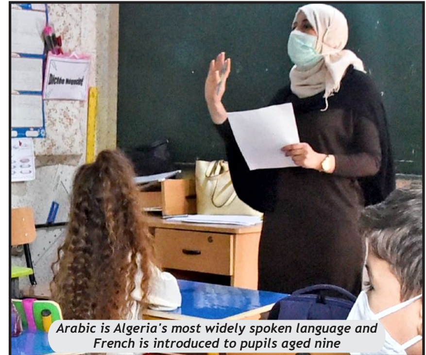
Arabic is Algeria’s most widely spoken language and French is introduced to pupils aged nine

But it caused outrage in France and a pro-French lobby within the Algerian government called for the scheme to be dropped. In the end the education minister was sacked. BBC