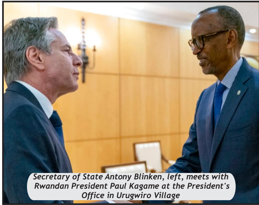
Secretary of State Antony Blinken, left, meets with Rwandan President Paul Kagame at the President's Office in Urugwiro Village

In a statement ahead of Blinken's visit, Rwanda's government said it "looks forward to a robust exchange of views on governance and human rights, as has always been the case in the Rwanda-U.S. bilateral relationship. VOA