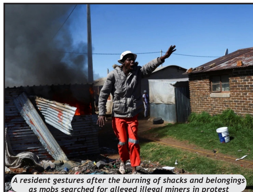
A resident gestures after the burning of shacks and belongings as mobs searched for alleged illegal miners in protest

Police had said they would use DNA kits to try to identify the alleged attackers from among those rounded up, as well as a police lineup. However, Mjonondwane