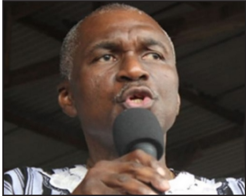
Leader of the Alternative National Congress (ANC), Mr. Alexander Cummings has said.