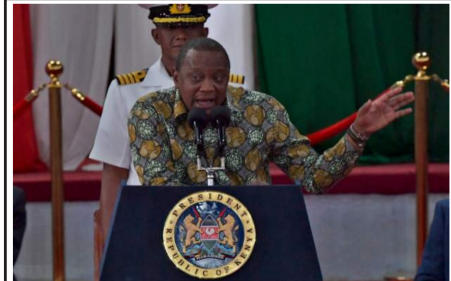
Uhuru Kenyatta was backing Raila Odinga to become the country's fifth president

K enya's President Uhuru Kenyatta said he will gladly hand over power to President-elect William Ruto, but insisted that his preferred successor Raila Odinga would have been a better option to lead the country.