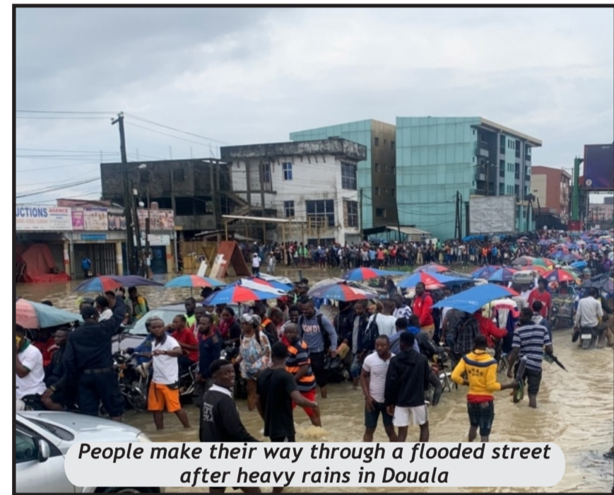
People make their way through a flooded street after heavy rains in Douala

MOKOLO , CAMEROON — In Cameroon, officials say weeks of flooding along its northern borders with Chad and Nigeria have swept away entire villages, leaving thousands of people