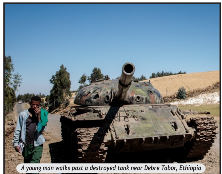
A young man walks past a destroyed tank near Debre Tabor, Ethiopia

Their call for a cease-fire was welcomed by the AU, the