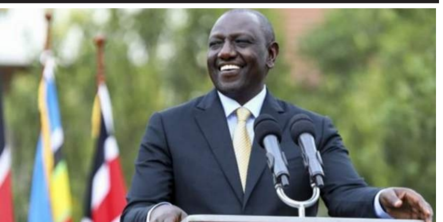
William Ruto will be sworn in on Tuesday as Kenya's fifth president

The team of Kenya's President-elect has barred local media from covering the presidential inauguration, offering exclusive broadcast rights to Multichoice Kenya Ltd, an affiliate of South African pay-TV group.