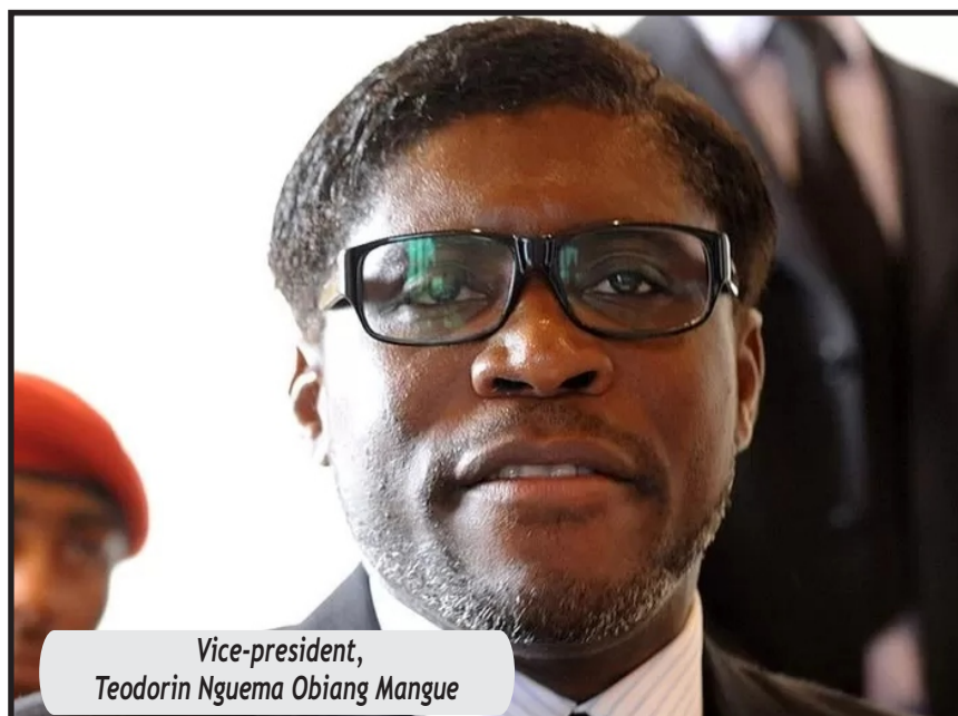
Vice-president, Teodorin Nguema Obiang Mangué

Obiang denied the charges, saying his wealth had come from legitimate sources, and sought to block the confiscation of the mansion in an appeals court. BBC