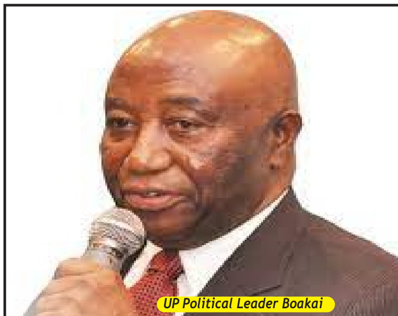
UP Political Leader Boakai