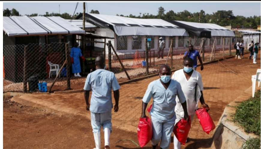
Health workers walk outside the Ebola isolation section of Mubende Regional Referral Hospital, in Mubende, Uganda, Sept. 29, 2022.

The World Health Organization and Ugandan authorities are seeking nearly $18 million to help contain the Ebola outbreak in the country for the next three months. The initiative comes as Uganda registers the death of the first health worker in the current Ebola outbreak and brings the total number of confirmed cases to 35, with seven deaths.