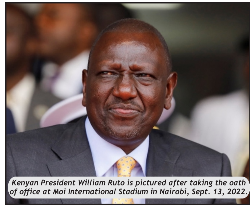
Kenyan President William Ruto is pictured after taking the oath of office at Moi International Stadium in Nairobi, Sept. 13, 2022.