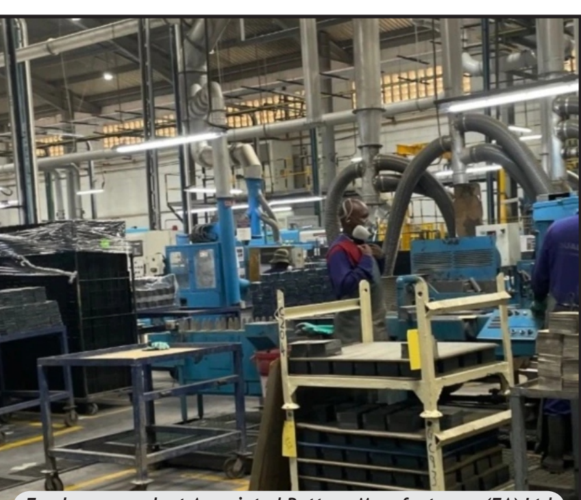
Employees work at Associated Battery Manufacturers (EA) Ltd

She urges civilians to seek medical help instead of taking psychiatric patients to traditional healers or pastors who claim they have miracle solutions to mental health problems. She says a majority of the mental patients government workers are assisting to recover their health are nervous, aggressive, irritated and violent. She simply says doctors and therapists should exercise more patience with psychiatric patients when the patients become violent. She says the country counts very much on doctors and therapists to reduce the growing number of mental patients.The World Health Organization reports that growing social and economic inequalities, protracted conflicts, violence and public health emergencies continue to take a toll on mental health, in Cameroon and worldwide.VOA