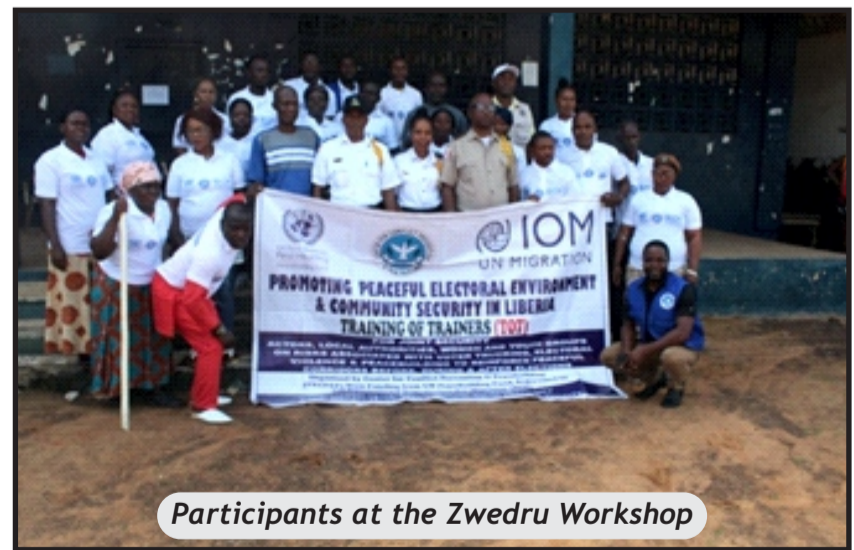
Participants at the Zwedru Workshop

brought together participants from River Gee, Maryland and Grand Gedeh Counties. The Zwedru ToT workshop taught participants on various topics such as Promoting Peaceful Electoral Environment Through Conflict Prevention and