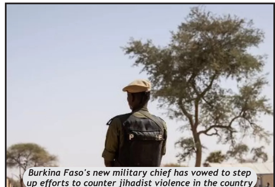
Burkina Faso's new military chief has vowed to step up efforts to counter jihadist violence in the country

No other officials have yet been charged over the scandal.