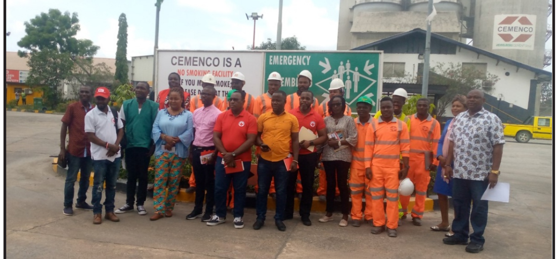
Employee of Liberia cement corporation and Liberian National Red Cross