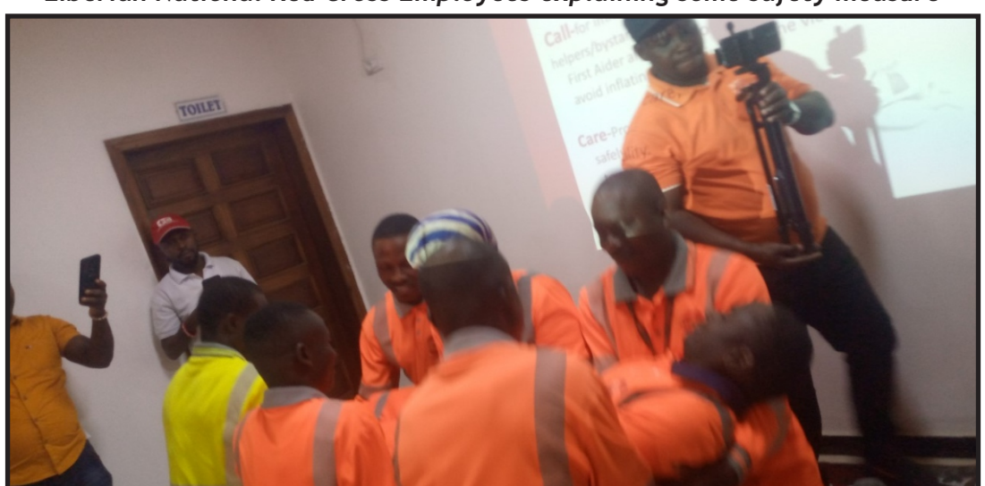
Liberian cement company employees demonstrating safety measures