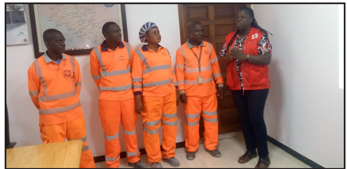
Liberian National Red Cross Employees explaining some safety measure