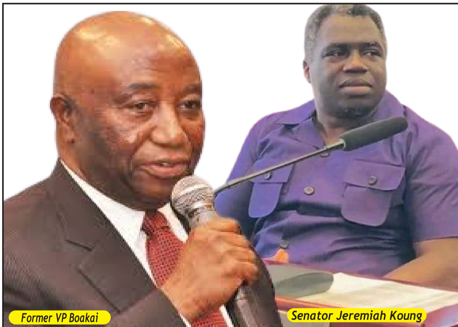
Former VP Boakai

To be honest, while the desperate decision by Boakai to endorse Koung as his running mate is aimed at winning the Presidential election, Boakai may likely ‘win’ but Liberia will be the loser! Hence, choosing Koung is NOT the act or behavior of a statesman, but that of a desperado. Those who genuinely love Liberia should be concerned about the huge risk the Boakai-Koung ticket poses to the immediate future of our country both domestically and on the international front. Imagine, Prince