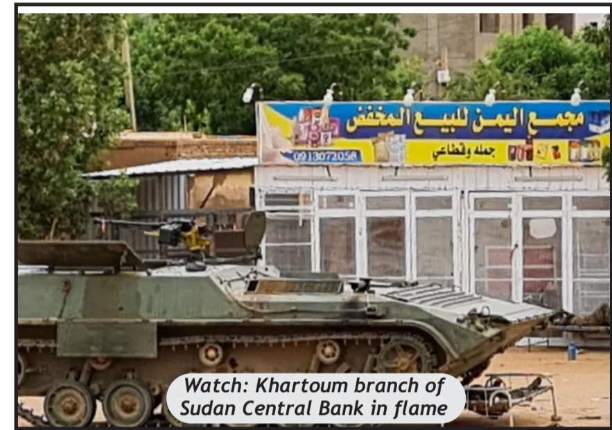
Watch: Khartoum branch of Sudan Central Bank in flame