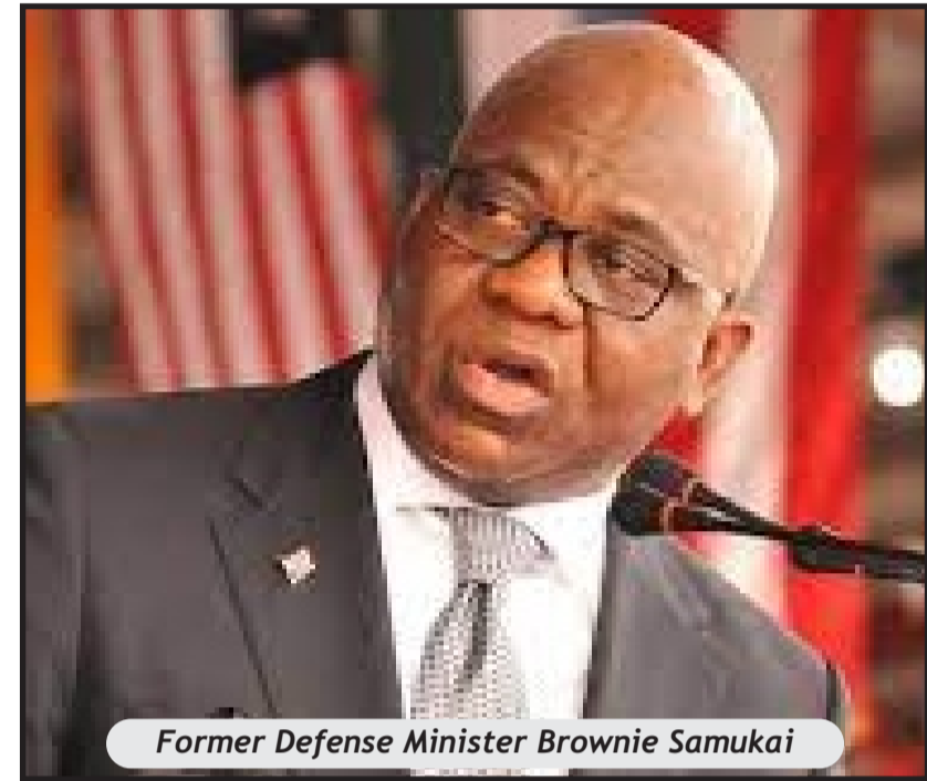
Former Defense Minister Brownie Samukai

to exercise political maturity and not break things apart.